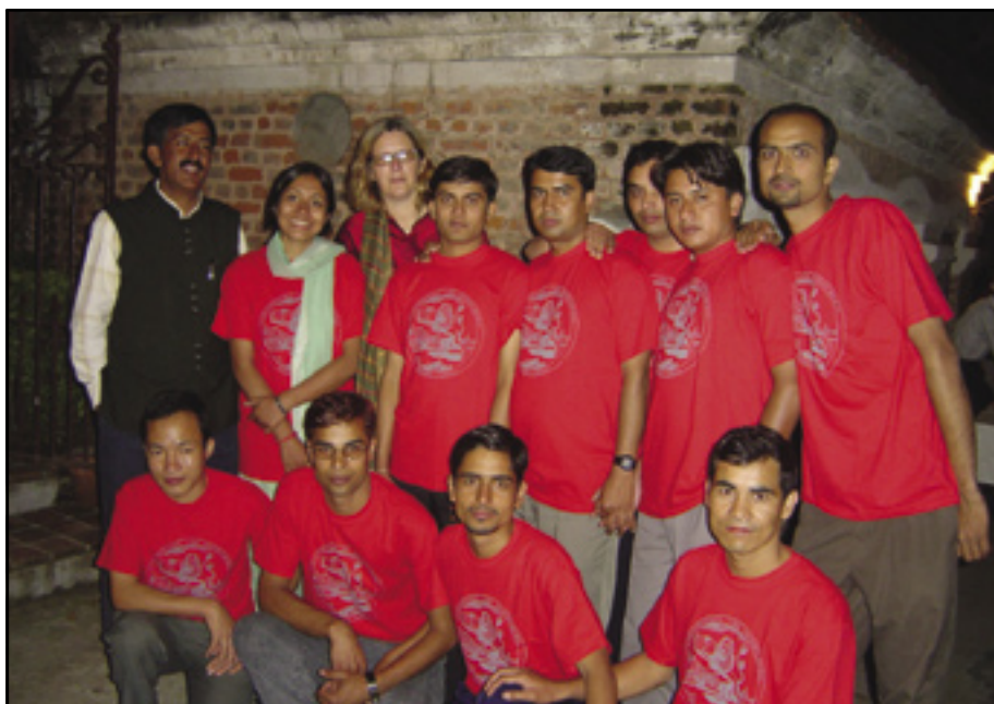
Participants of the M.A. support scheme.

As the last examples show, the SAI is linked with partner organisations in the guest country. In cooperation with the