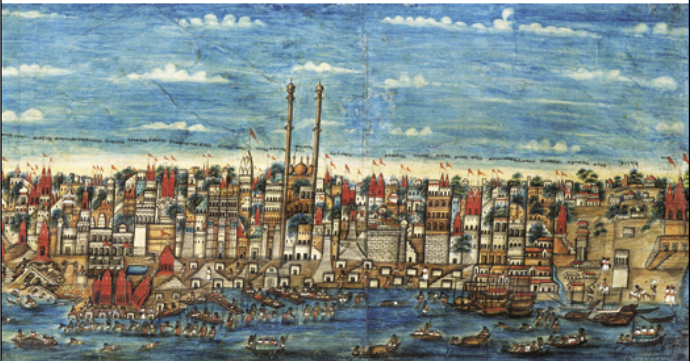
Panorama of Banaras (second half of 19th century). Museum der Kulturen, Basel, IIa 9939.

The interdisciplinary Vārāṇasī Research Project was carried out during the years 2000 to 2002 at the SAI and funded by the DFG. We would like to announce two publications linked to the activities of this research group.