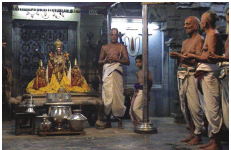
Acquiring ritual competence: priestly education in Kāñcīpuram

The project studies the texts deemed relevant by the main actors and other par-