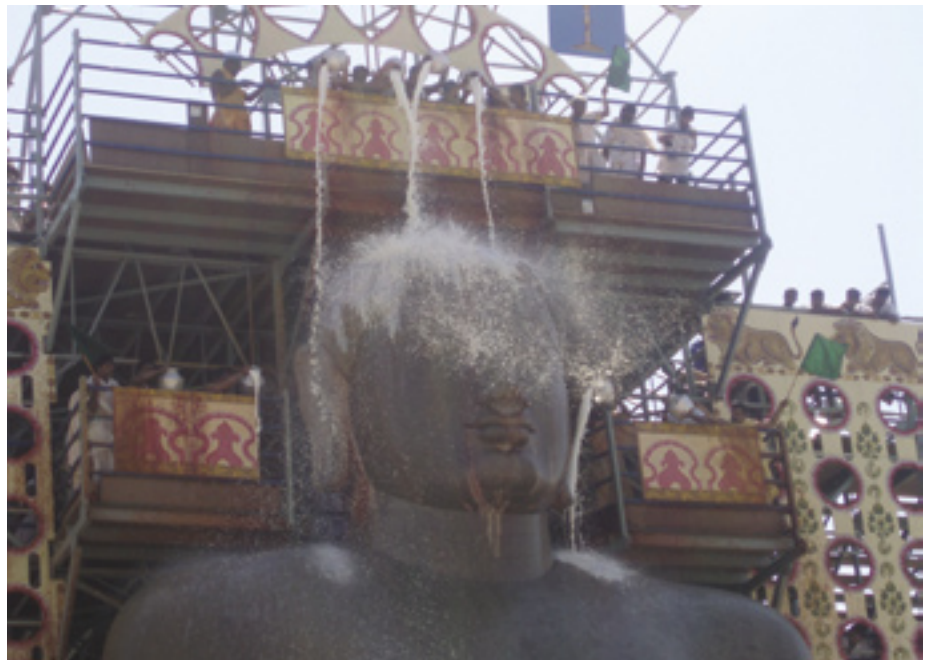
Purification of the statue of Gomateshvara.