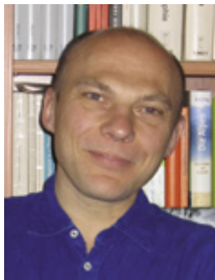
Prof. Nüsser

the beautiful countryside is actually ideal for long-distance running and biking.