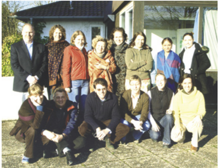
Participants of the Medical Anthropology course.