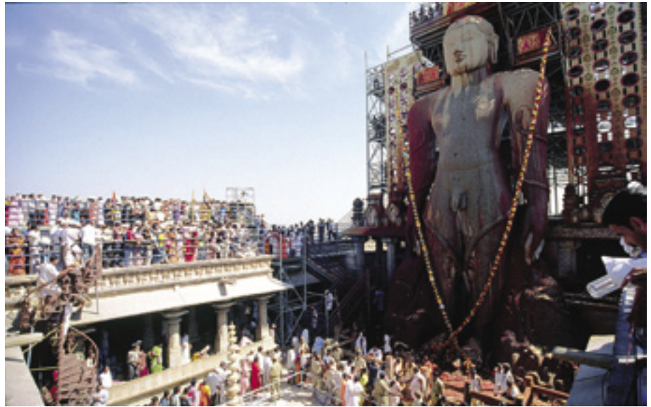
The Mahamastakabhisheka ceremony at Shravanabelgola.