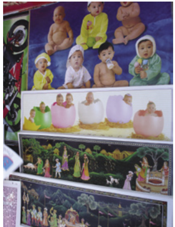
Bazaar prints in New Delhi, 2005: An example of the visual objects collected and digitized for the virtual electronic archive