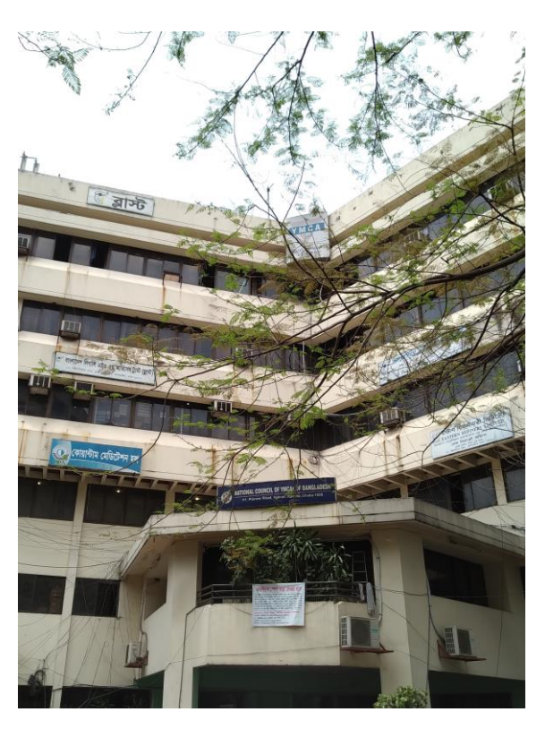
Figure 3: BLAST Centre (sign top left)

Other non-governmental development organizations based in Dhaka which advocates for the recognition and realization of prisoners' rights are Bangladesh Legal Aid and Services Trust (BLAST) and Dhaka Ahsania Mission (DAM). BLAST provides legal aid, advice and representation to groups of people belonging to civil, criminal, family, labour and land law areas. This organization has been involved in the IRSOP project "to provide legal assistance to indigent prisoners under trial" (BLAST, 2010). The impact of the project is described as noteworthy since, between January 2009 and September 2014, a total of 4.549 prisoners had been released