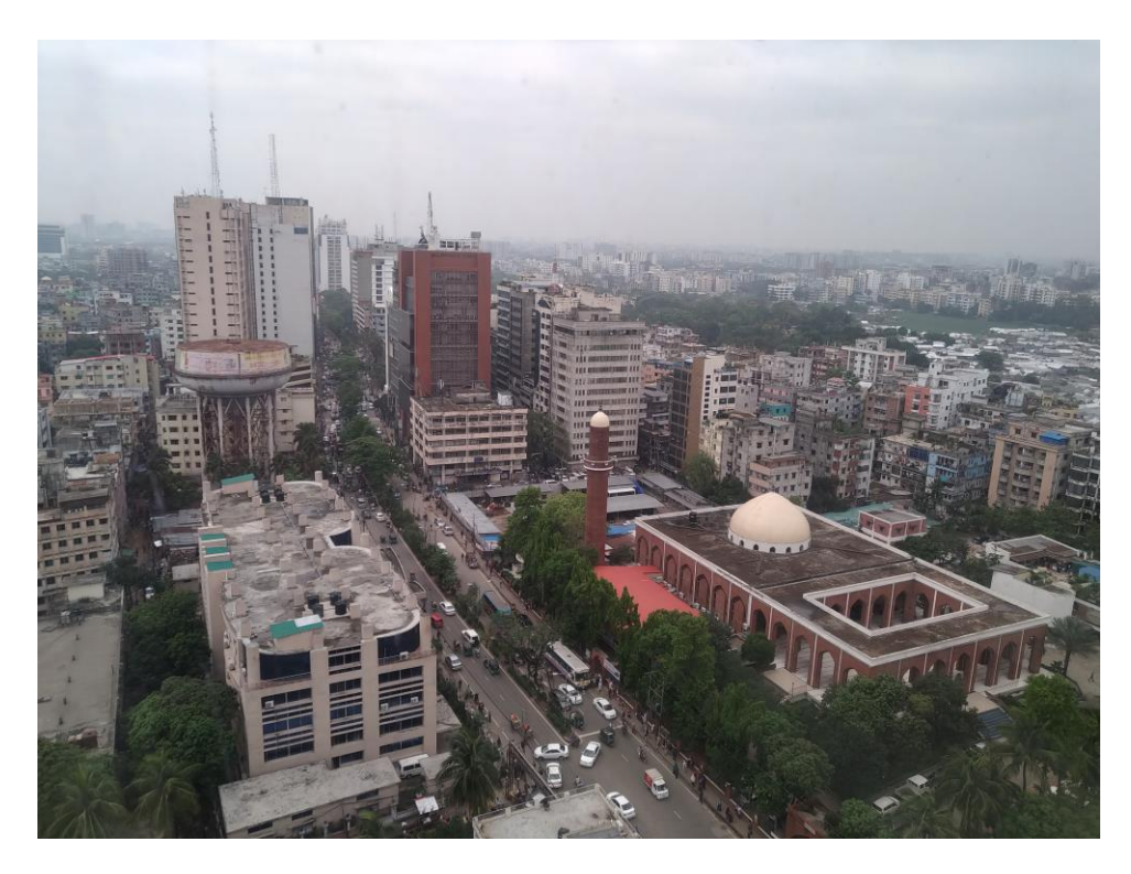
Figure 5: View of Dhaka from the 19th floor of the BRAC Centre

Bangladesh centre, and the Registered Head Office of the Quantum Foundation; I also attended a Quantum Meditation event. My husband and I reached the field sites by car, mostly by using Uber. He assisted me by working as an interpreter and by translating from Bengali whenever it was necessary. I further perceived that his presence facilitated trust and rapport building with my informants.