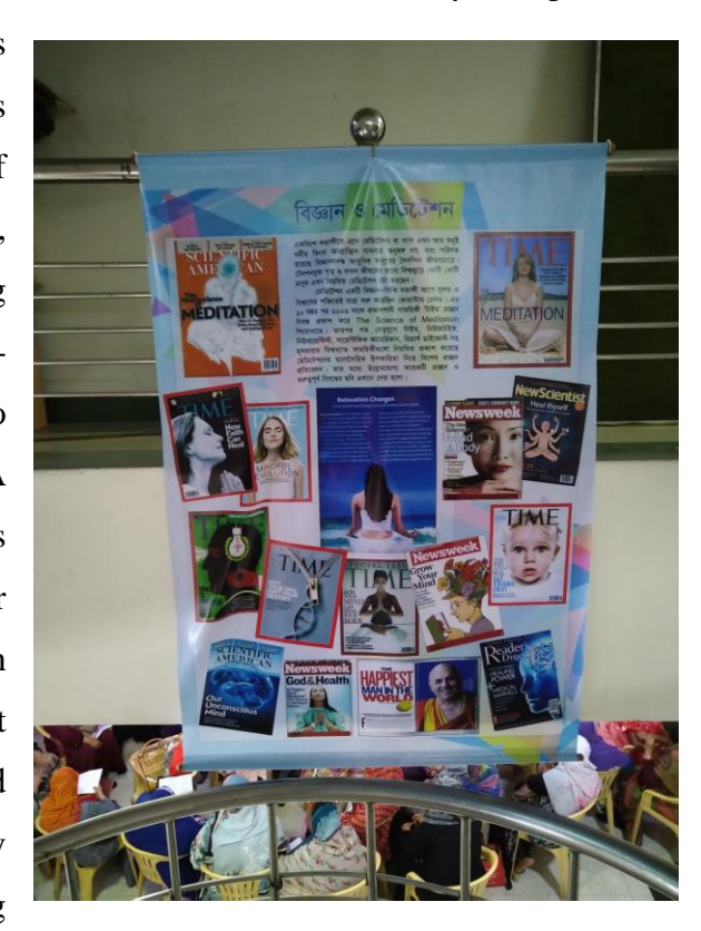
Figure 8: Poster entitled 'Science and Meditation' by Quantum Foundation

practiced in a country where meditation does not seem as common as in many other parts of the world. Through the merging of discipline, health, science, and spirituality, meditation is described as something concretely useful not only for selfdevelopment and spiritual growth, but also for individual and social well-being. A visual example of the attention towards scientific aspects of meditation is a poster found at the Quantum Foundation conference reporting a short text about 'bijñan o medițeśon' - that is 'science and meditation', and the cover pages of many Western magazines showing eye-catching images and titles regarding the research on meditation.