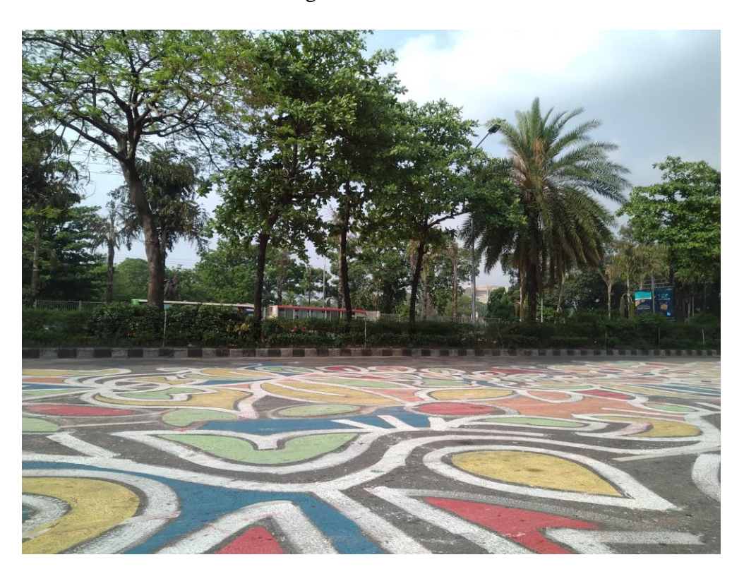
Figure 4: Painted road for Pohela Boiśakh, the Bengali New Year

Before moving on to the theoretical framework and data analysis, I would like to provide a brief introduction to the context in which I conducted my fieldwork. This research focused on Dhaka, the capital of Bangladesh, and included the neighbouring town of Narsingdi. I travelled with my husband, who is Bangladeshi-Italian, and some of his relatives welcomed and hosted us in their home. We mainly stayed in the diplomatic area, a very peaceful zone if compared with the rest of the city. Almost all the places I came across to reach the field sites were very crowded and chaotic, but rich with vegetation and brightened by colours on the walls, roads, painted rickshaws and trucks. Since I had already been to Bangladesh six years previously, traffic jams and uncommon driving rules were not so shocking for me. However, I noticed the increasing number of cars, traffic lights and paved roads, as well as higher buildings – many of them under construction. Thankfully, hospitality and delicious local food have not changed at all.