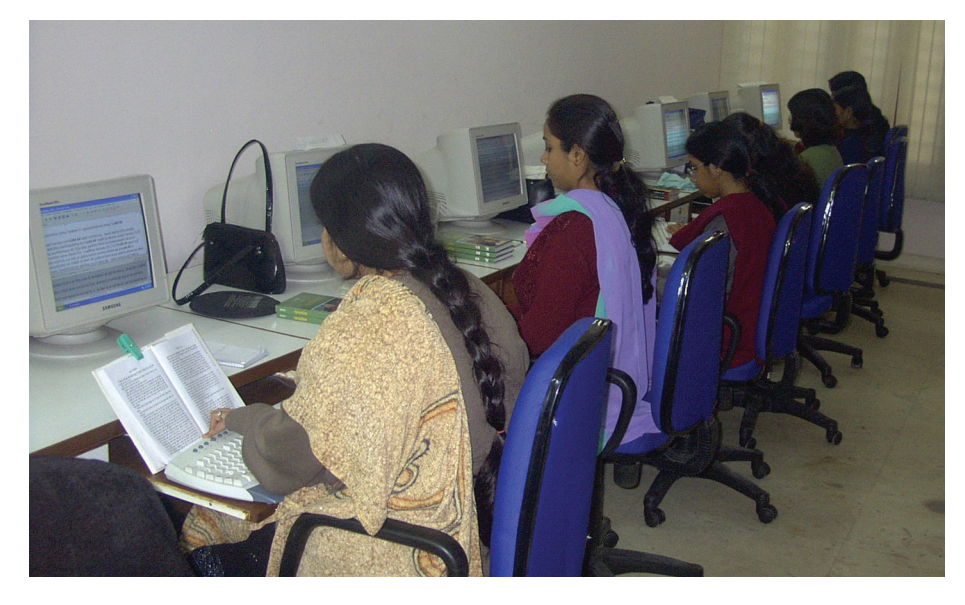
From India to Germany: Indian computer operators at the project office in Delhi prepare Hindi texts for the databank in Bayaria.

undergo a semi-automatic grammatical tagging. This means that every word is equipped with information regarding its inflection form and part of speech in order to guarantee that a search for a certain pronoun, verb etc. will list all its variants. The texts are scanned by an inbuilt Hindi dictionary which needs per-