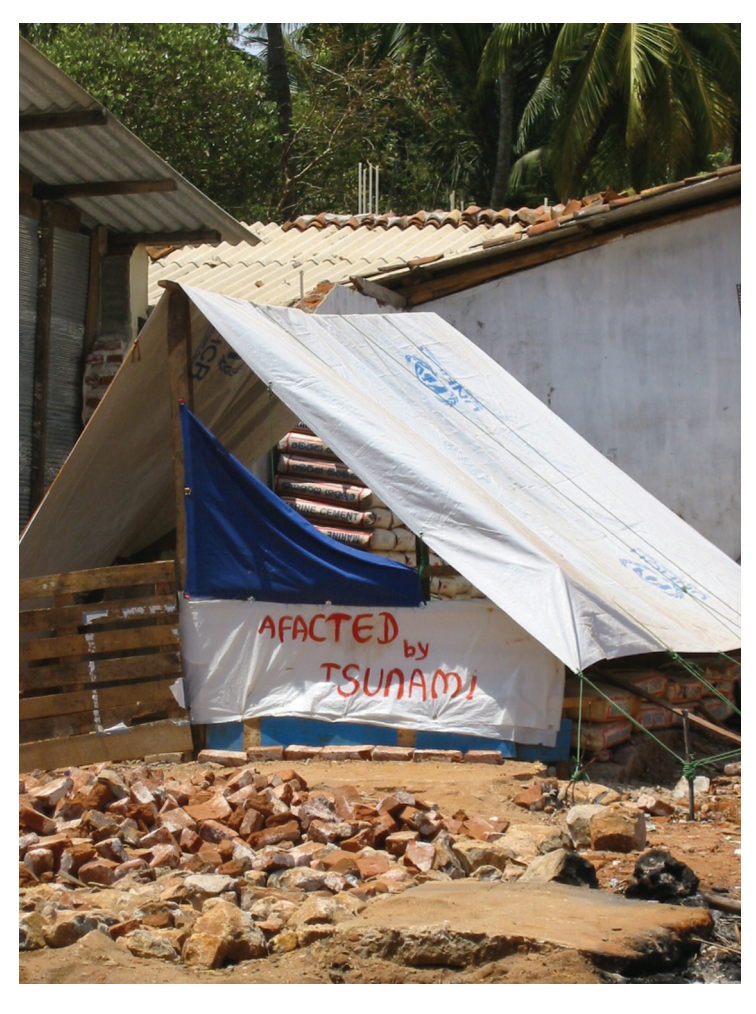
Affected by the tsunami: Members of the South Asia Institute are trying to assist the efforts to fight desasters - as scholars, but also in the field.

Hartmut Fünfgeld also describes the socio-political restraints of the difficult