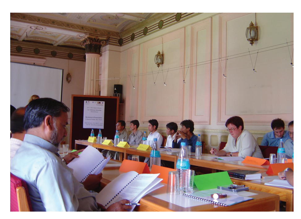
Workshop held at GTZ with the students forming the M.A. support scheme (September 2004).

The second pillar of this scheme are a series of classes on aspects relating to their research, such as methodology, building up and analysing data bases, as well as visualising findings, where all the