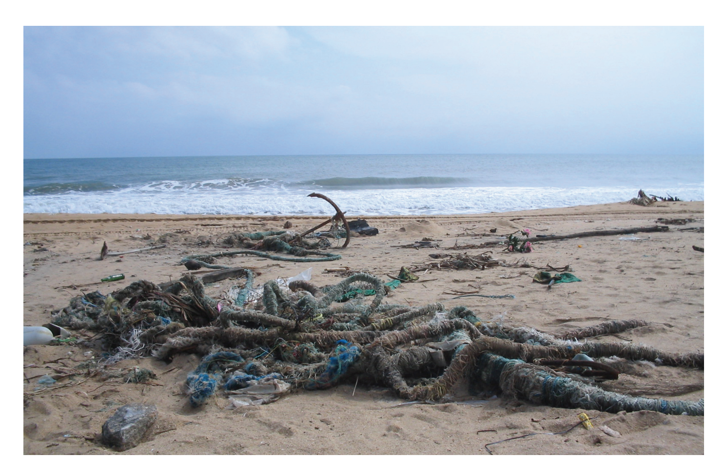
Fishermen depend on their equipment – the SAI provides help to 422 fishermen in Pottuvil (Sri Lanka)

www.sai.uni-heidelberg.de info@sai.uni-heidelberg.de Tel: +49 6221 548900 Fax: +49 6221 544998