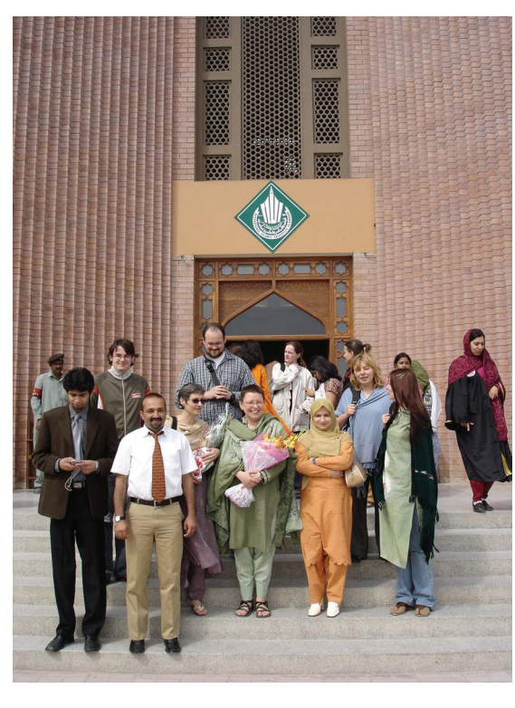
Visit to the International Islamic University, Islamabad.

like situation at the university campus where we all stayed and studied together, far removed from our usual daily routine. The atmosphere remained very cordial and informal throughout. Our stay at Erfurt was made even more pleasant by the fine weather, the beauty of the city