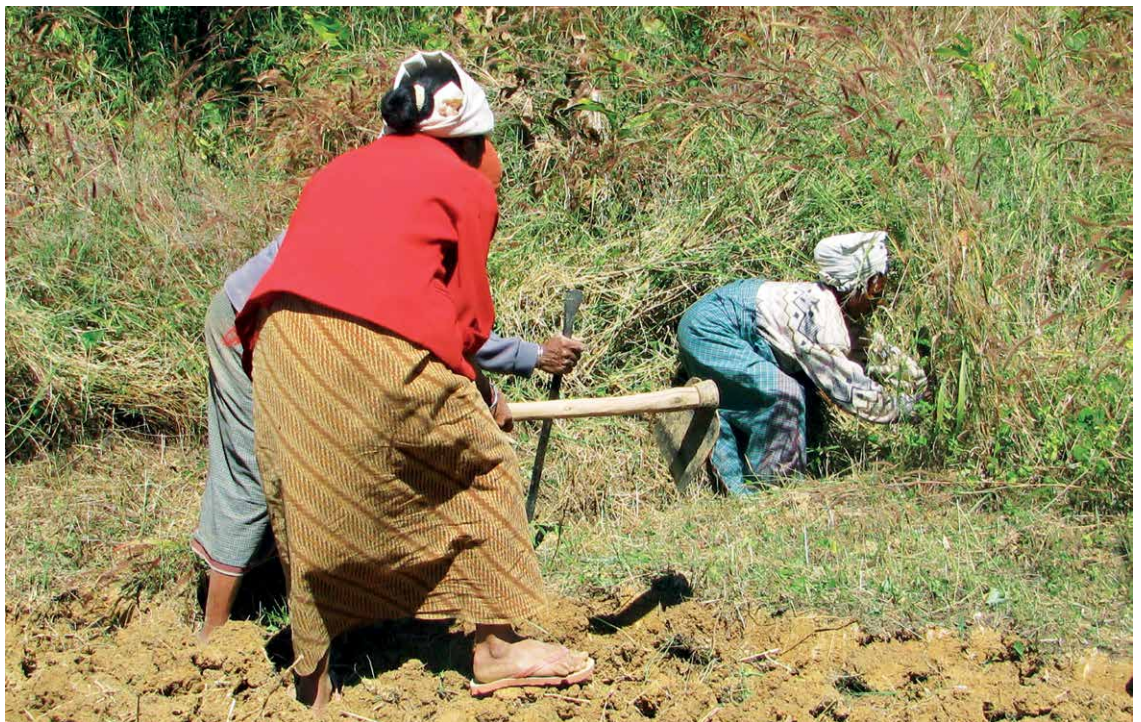
Women working the land