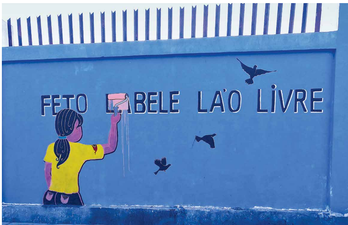
“Women cannot move freely”, the group Buibere nia Riska painted murals concerning the socioeconomic function and participation of women on the walls of the national stadium in Dili in september 2019.

In a process of mediation between the uncles as male representatives of their families, the type and amount of barlaki is determined, with the aim of tying the families together and sealing the union. This practice excludes women from the decision making process in two ways: for centuries they could neither decide what kind of marriage they wanted, nor what conditions should apply to the husband's family. This led to the practice being reinterpreted as a dowry, with the men gaining ownership of the women, who are in turn commodified, making some men feel justified in regulating, controlling or domestically abusing their wives.