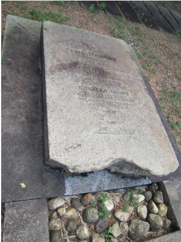
5 Guangzhou: Foreigners' Cemetery: Broken tombstone ©2018