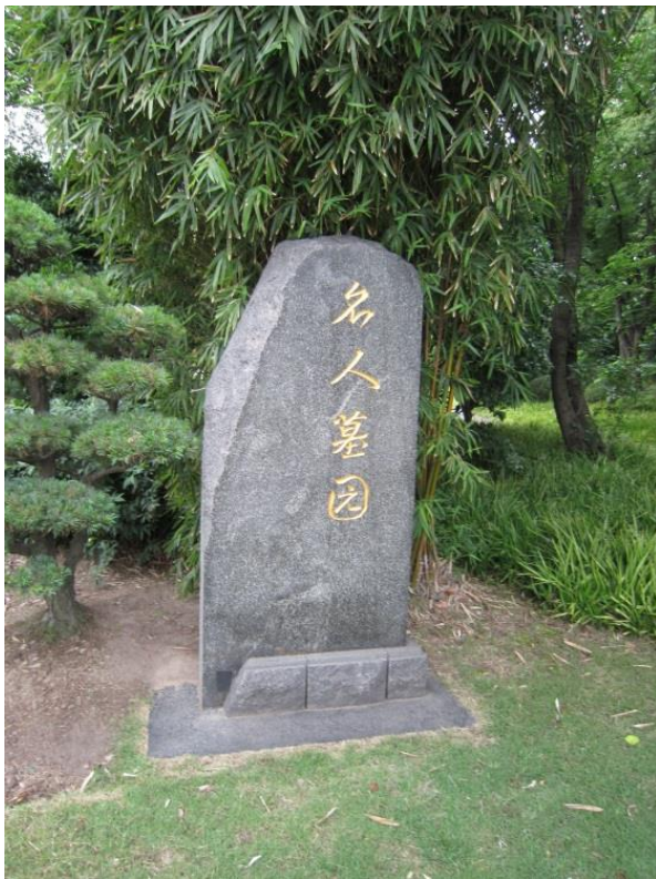
16 Shanghai: Song Qingling Memorial Park: section of the famous Chinese