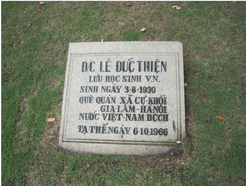
24 Shanghai: Song Qingling Memorial Park: Vietnamese tombstone resembling a death announcement ©2018