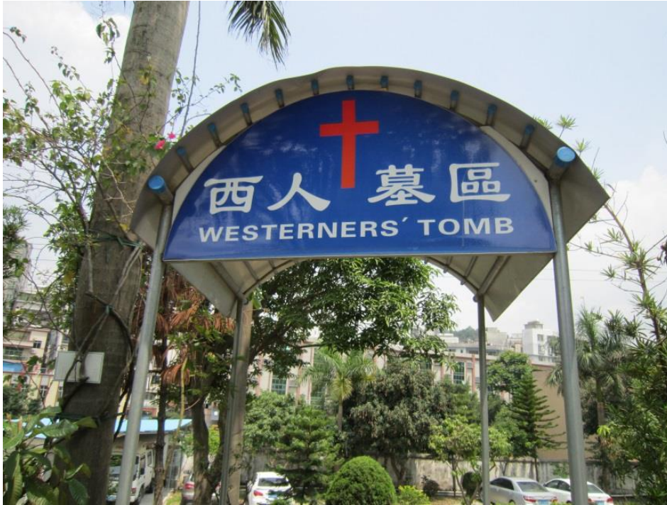
7 Guangzhou: Protestant Dawoling Cemetery: Westerners' tombs area ©2018