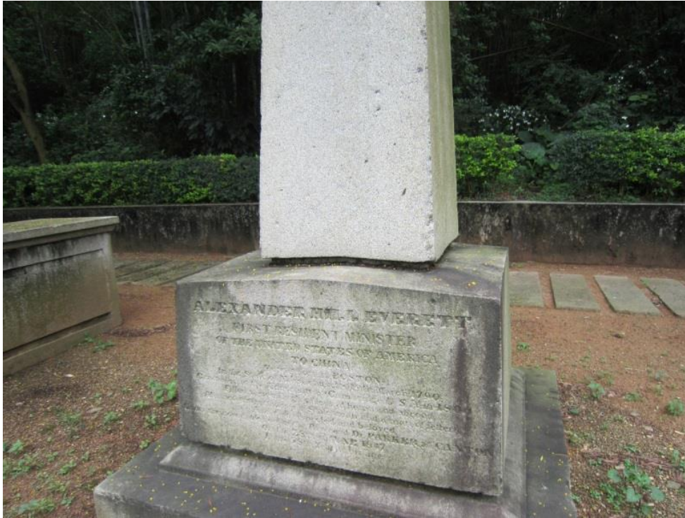
3 Guangzhou: Inscription on the tomb of the First U.S. Minister to China