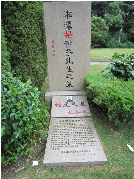
40 Shanghai: Song Qingling Memorial Park: tomb of Yang Du