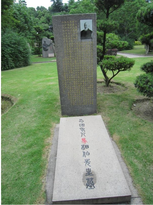
41 Shanghai: Song Qingling Memorial Park: newly set up tomb of Ma Xiangbo ©2018