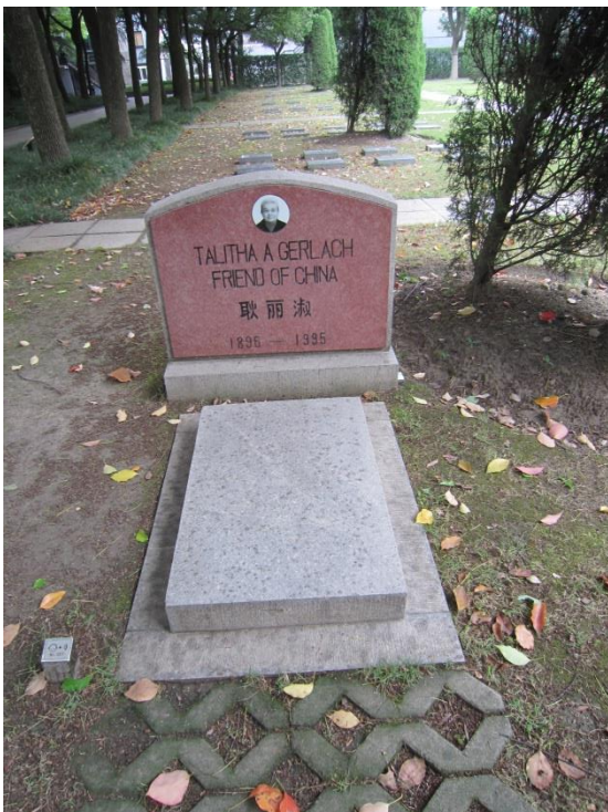
26 Shanghai: Song Qingling Memorial Park: tomb of T. Gerlach, friend of China© 2018