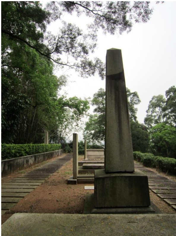
2 Guangzhou: Tomb of the First U.S. Minister to China ©2018