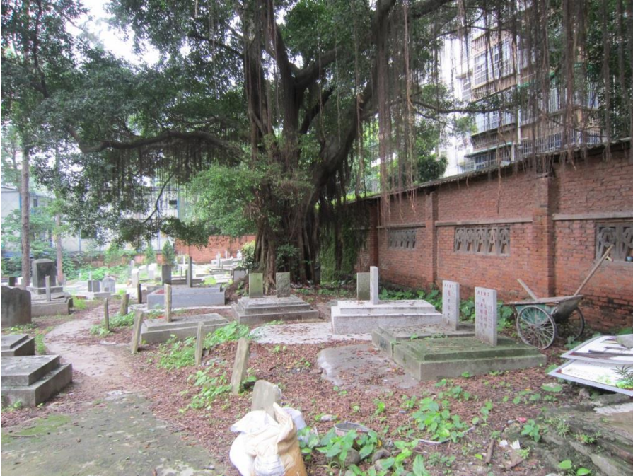
13 Guangzhou: Lingnan University Cemetery ©2018