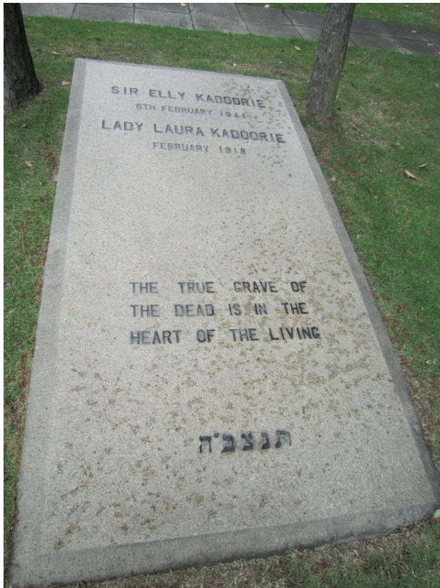
28 Shanghai: Song Qingling Memorial Park: tombstone of the Kadoorie couple