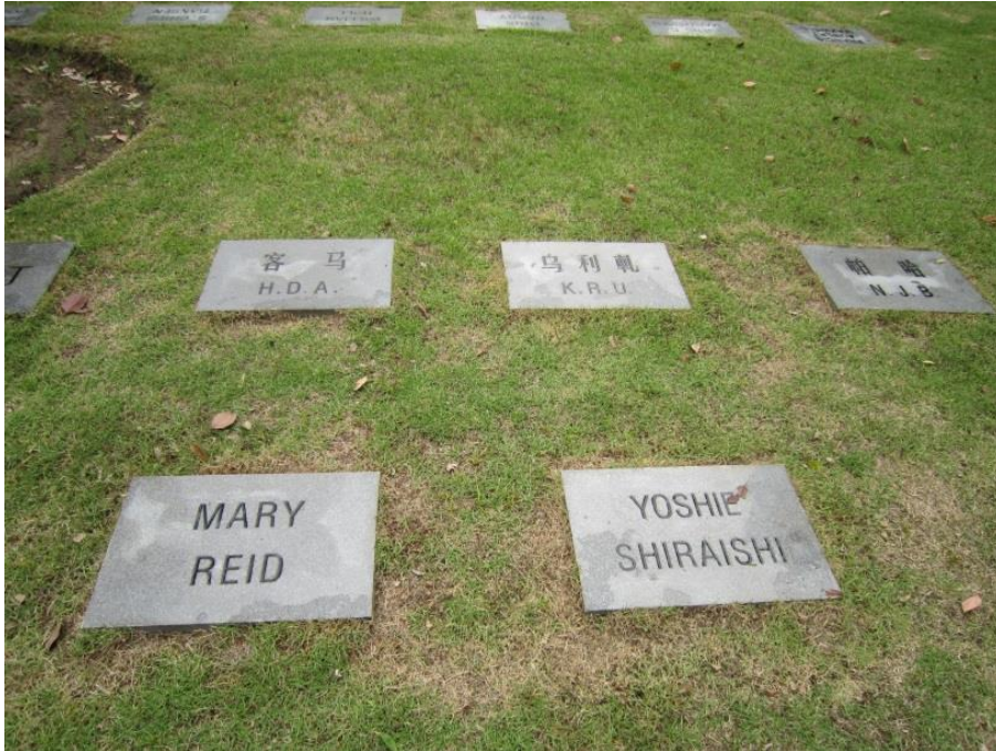
31 Shanghai: Song Qingling Memorial Park: mixture of nationalities, including even Japanese, and unclear identities