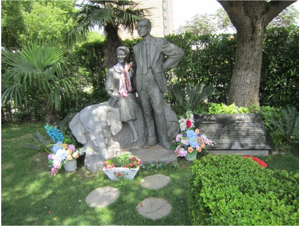
43 Shanghai: Fushouyuan ©2018