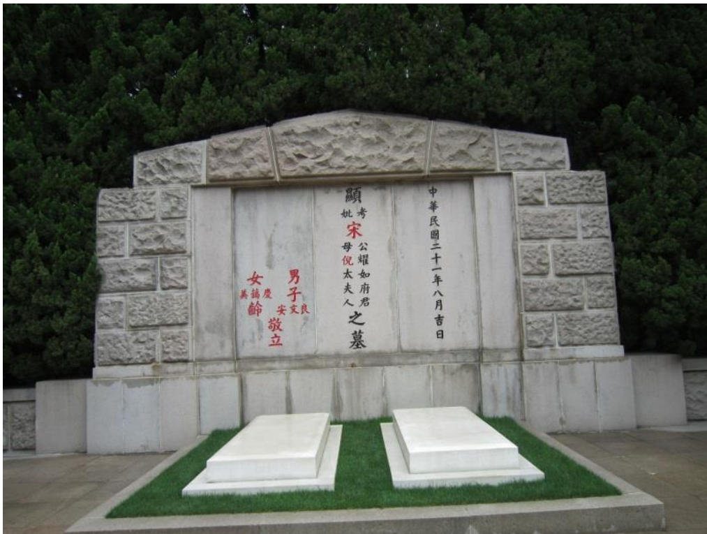
34 Shanghai: Song parents' tomb with all children's names ©2018