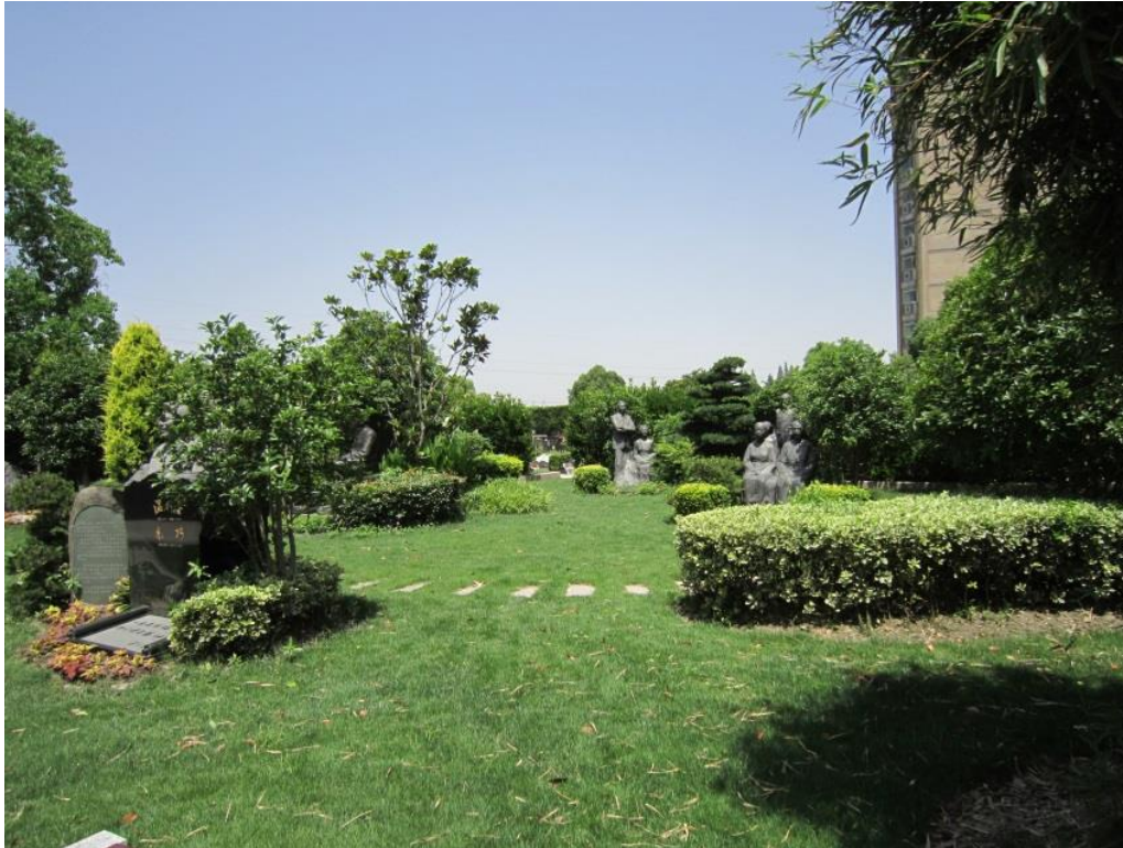
44 Shanghai: Fushouyuan ©2018