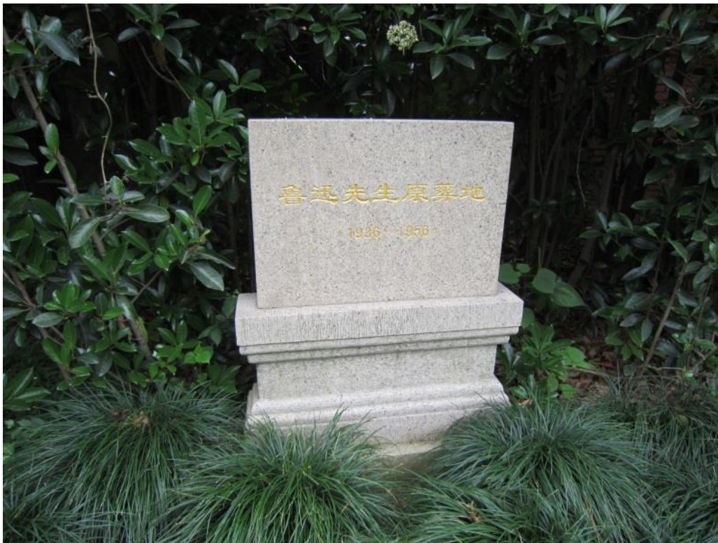
18 Shanghai: Song Qingling Memorial Park: original place of Lu Xun's tomb ©2018