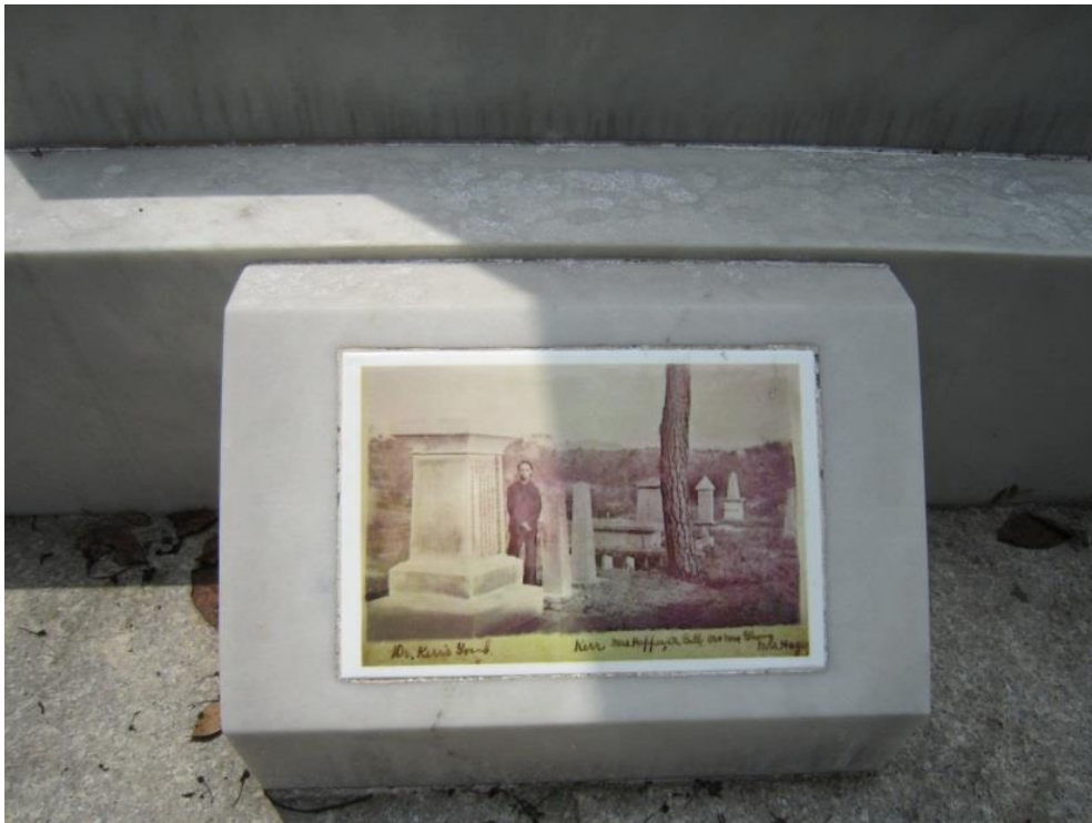
10 Guangzhou: Photograph of the old Kerr tomb shown on spot ©2018