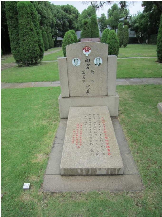
20 Shanghai: Song Qingling Memorial Park: tomb of the Amemiya couple