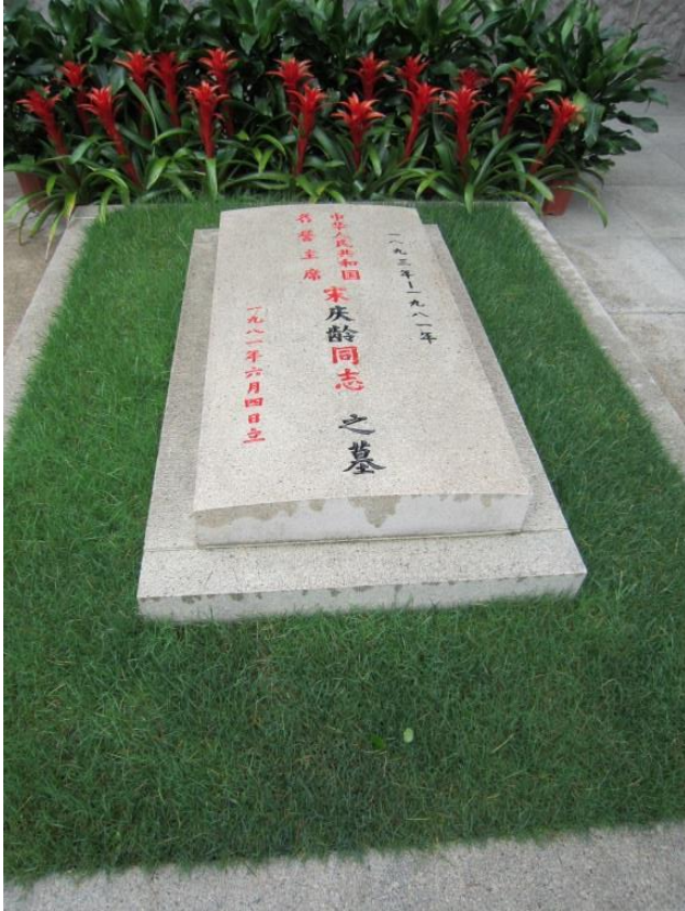
35 Shanghai: Song Qingling's tomb ©2018