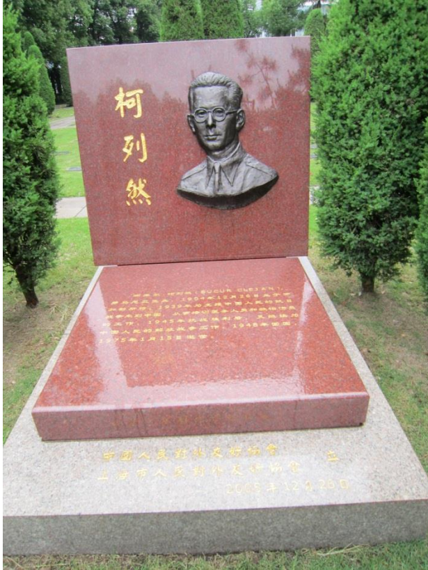
25 Shanghai: Song Qingling Memorial Park: tomb of Bucur Clejan ©2018