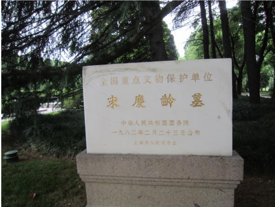
37 Shanghai: Song Qingling Tomb heritage plaque ©2018