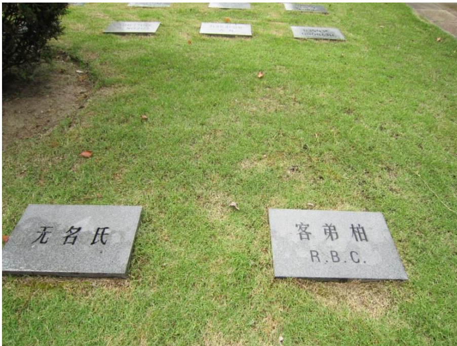
32 Shanghai: Song Qingling Memorial Park: examples of unclear identities ©2018