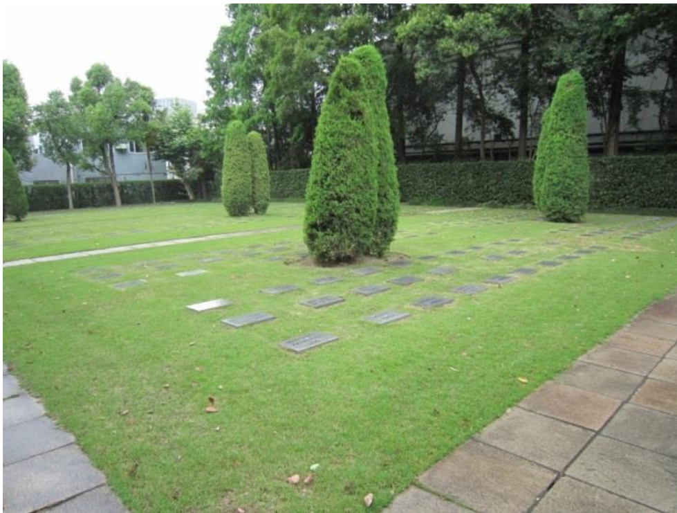
30 Shanghai: Song Qingling Memorial Park: small concrete slabs