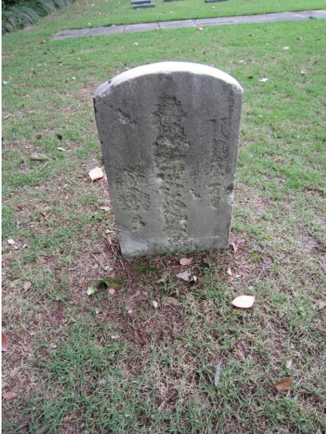
23 Shanghai: Song Qingling Memorial Park: Vietnamese student's tombstone: the backside