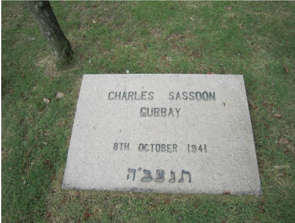
29 Shanghai: Song Qingling Memorial Park: one of the Sassoon Gubbay tombstones ©2018