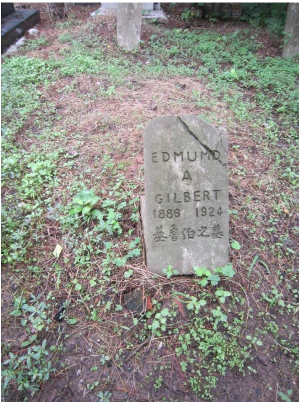
14 Guangzhou: Lingnan University Cemetery: broken foreigner's tombstone ©2018