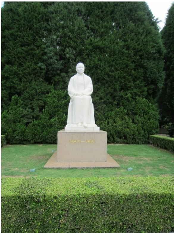
42 Shanghai: Song Qingling tomb: statue ©2018