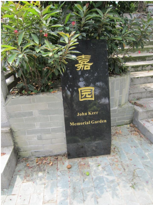
8 Guangzhou: Kerr Memorial Garden