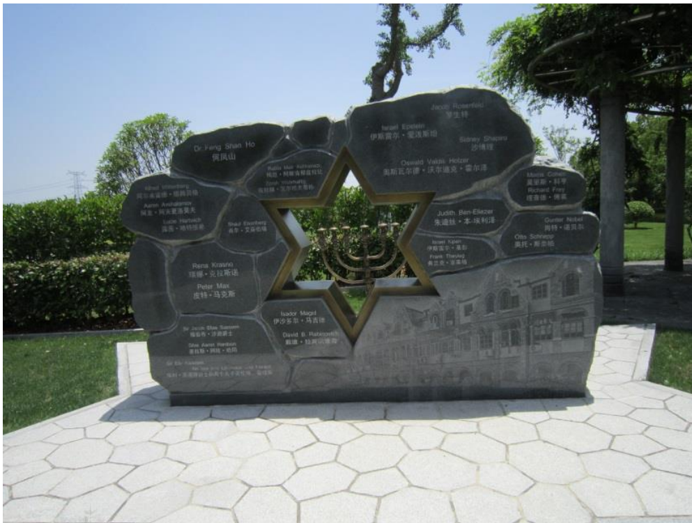
46 Shanghai: Fushouyuan: Jewish memorial