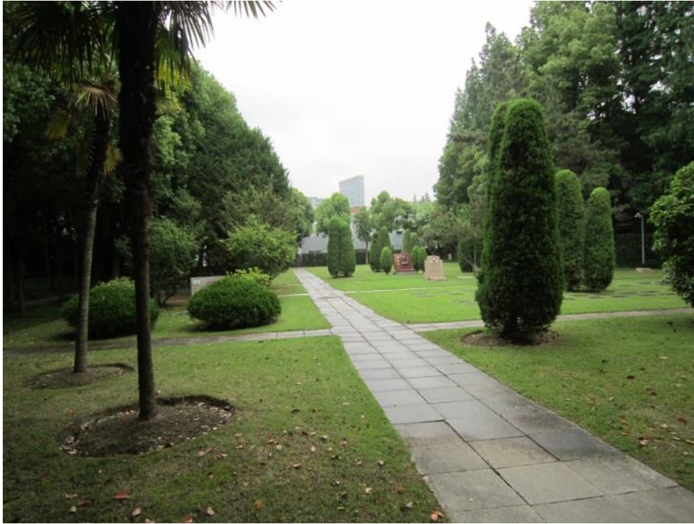
15 Shanghai: Song Qingling Memorial Park: “Foreigners’ Tomb Area”