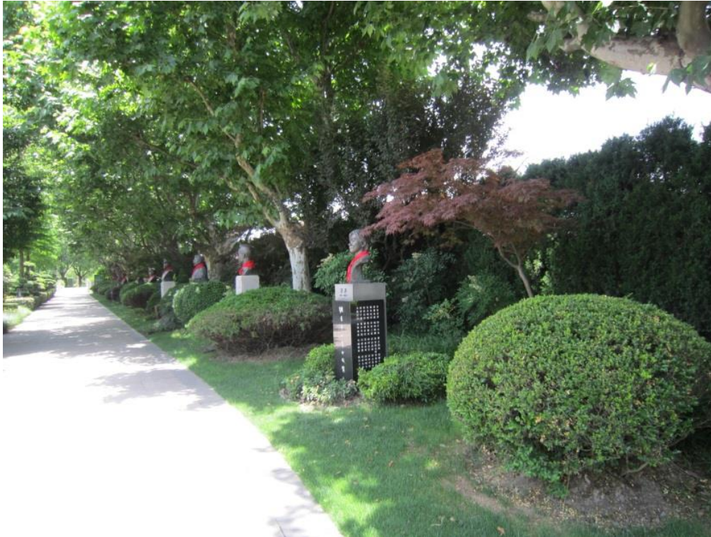
45 Shanghai: Fushouyuan ©2018