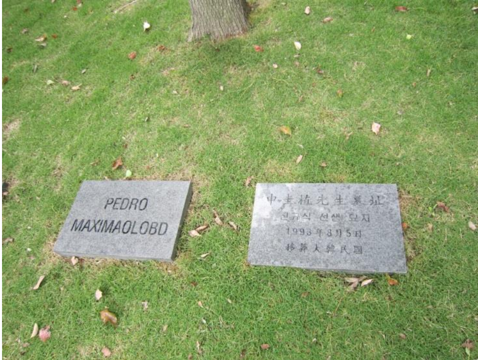
21 Shanghai: Song Qingling Memorial Park: one of the repatriated Koreans: Sin Kyusik ©2018