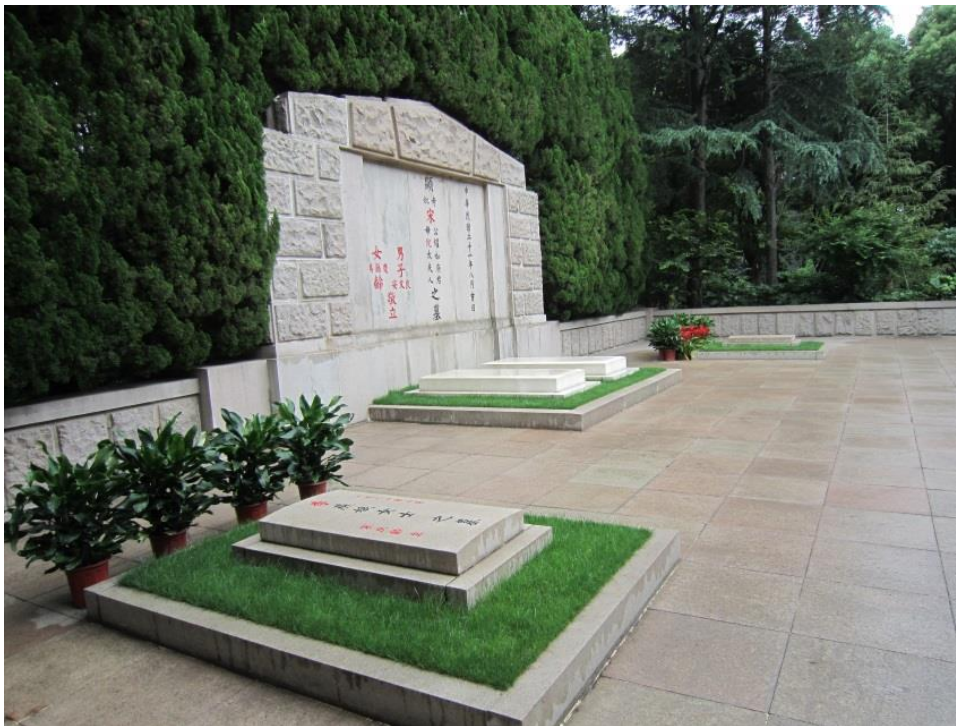
36 Shanghai: Song parents' tomb with Song Qingling's and Ms. Li's in front ©2018