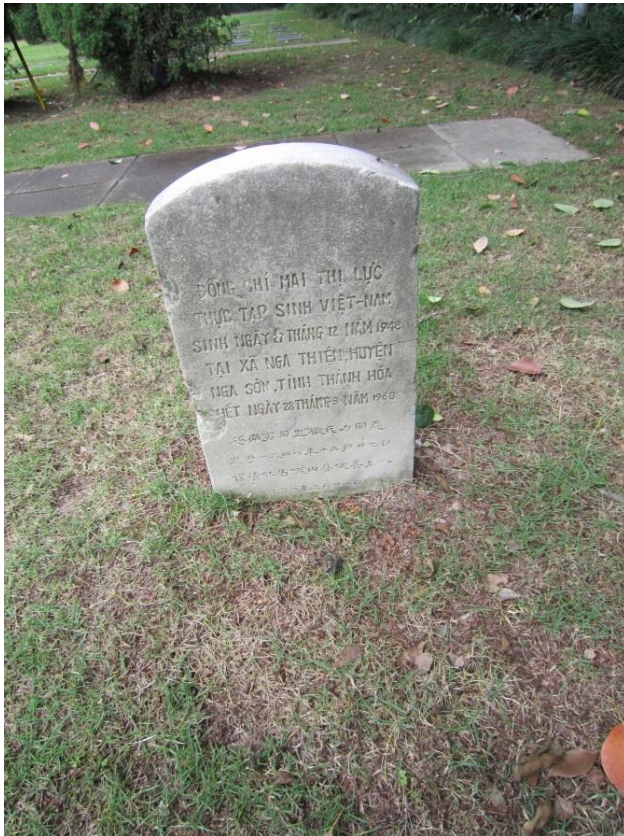
22 Shanghai: Song Qingling Memorial Park: Vietnamese student's tombstone ©2018