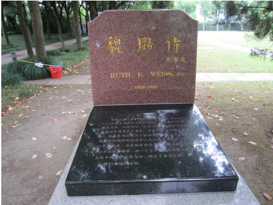
27 Shanghai: Song Qingling Memorial Park: tomb of Ruth Weiss ©2018