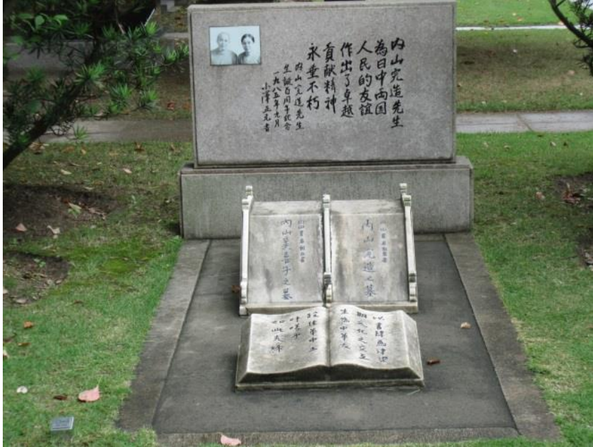
19 Shanghai: Song Qingling Memorial Park: tomb of the Uchimura couple ©2018