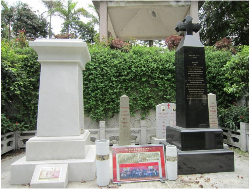
9 Guangzhou: Kerr family tombs ©2018