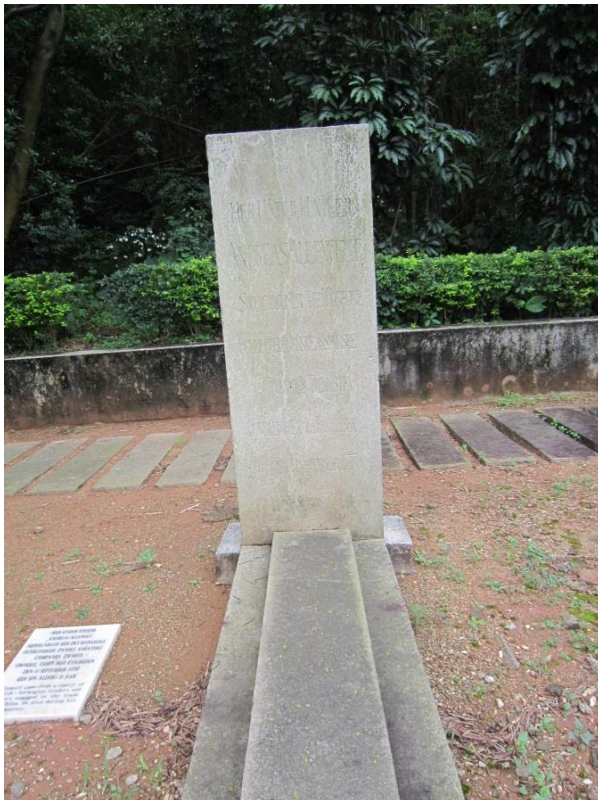
4 Guangzhou: Foreigners' Cemetery: Danish tombstone with explanations provided by the Danes ©2018