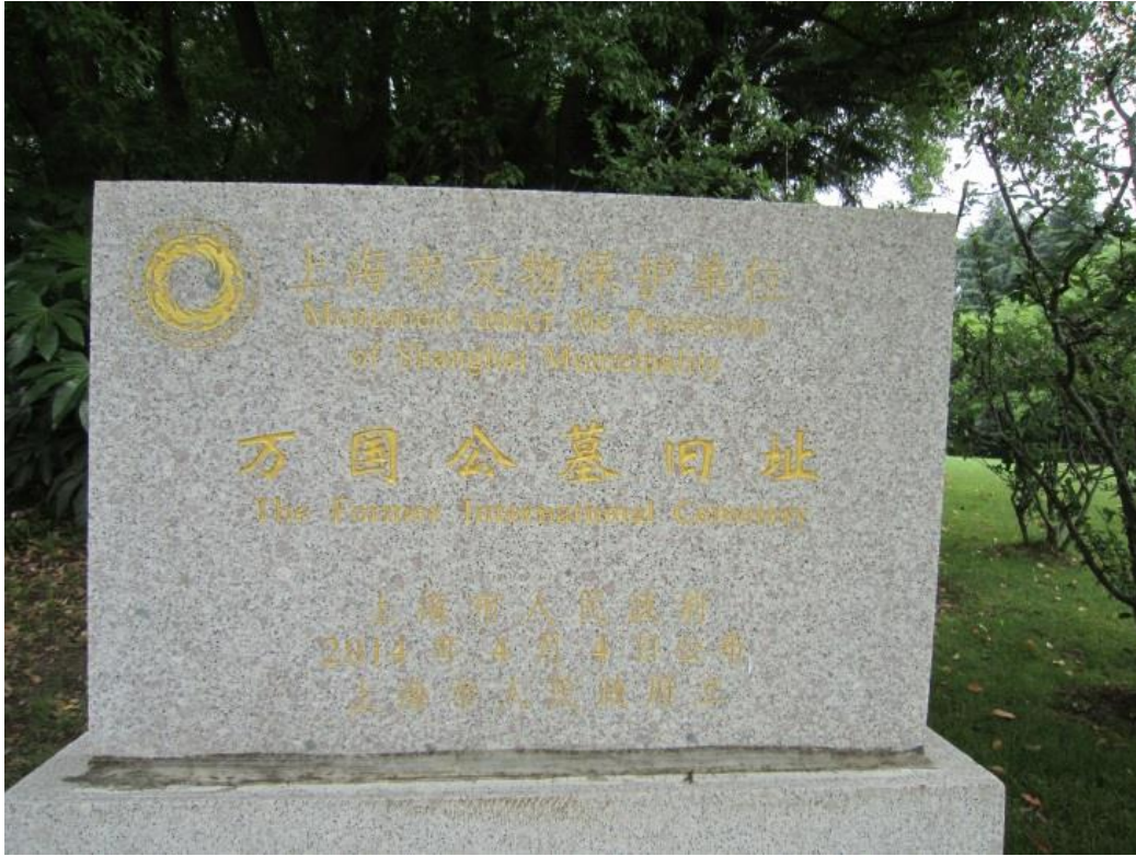
17 Shanghai: Song Qingling Memorial Park: old site of the “Wanguo gongmu” ©2018