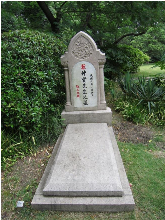
38 Shanghai: Song Qingling Memorial Park: tombstone of Li Zhongshi ©2018