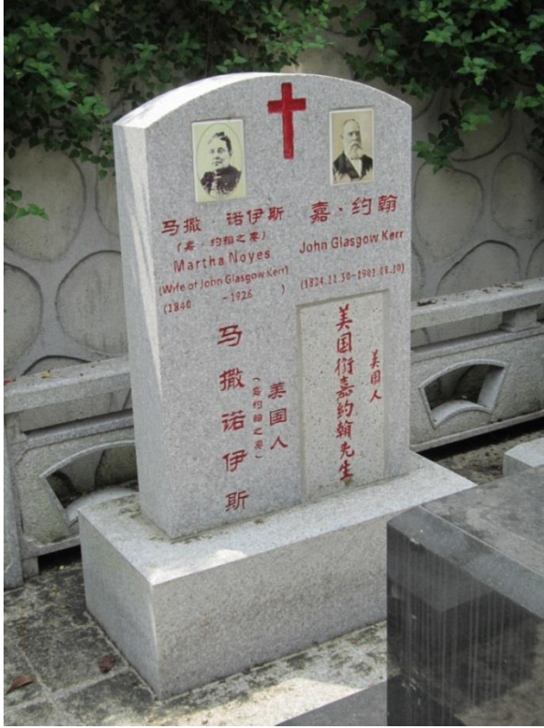
11 Guangzhou: New Kerr tomb ©2018