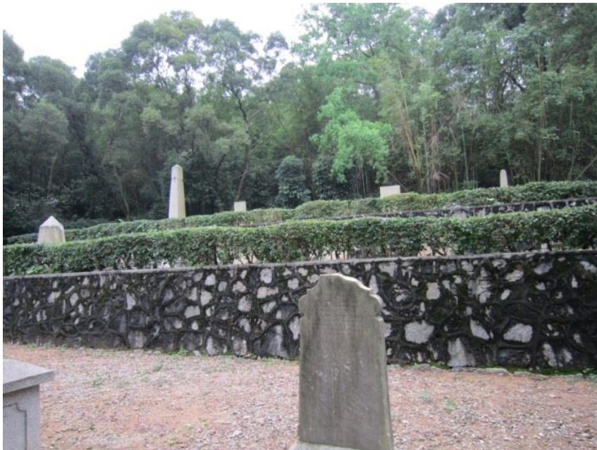
6 Guangzhou: Foreigners' Cemetery