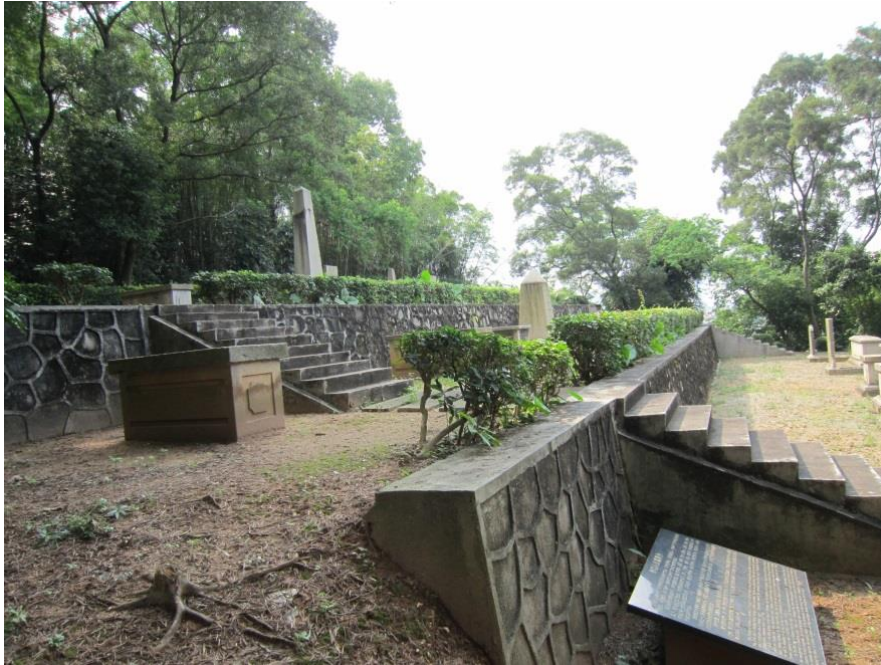
1 Guangzhou: Foreigners' Cemetery ©2018

Illustrations: (copyright: Gotelind Müller)