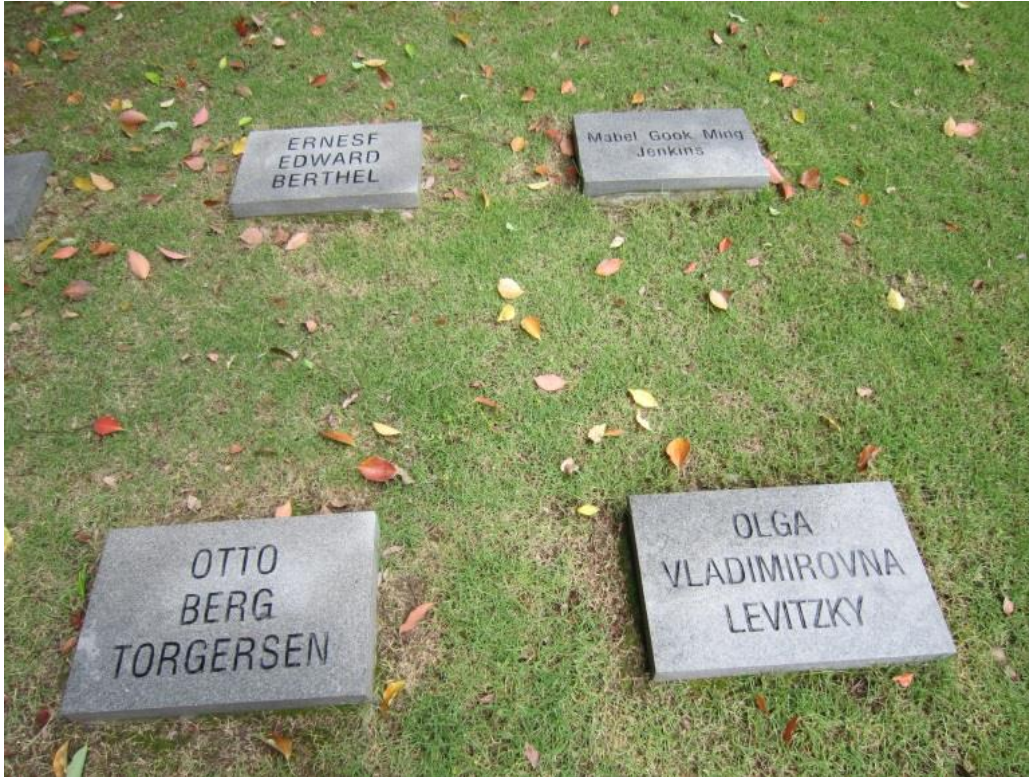
33 Shanghai: Song Qingling Memorial Park: concrete slabs including one Russian woman's name ©2018