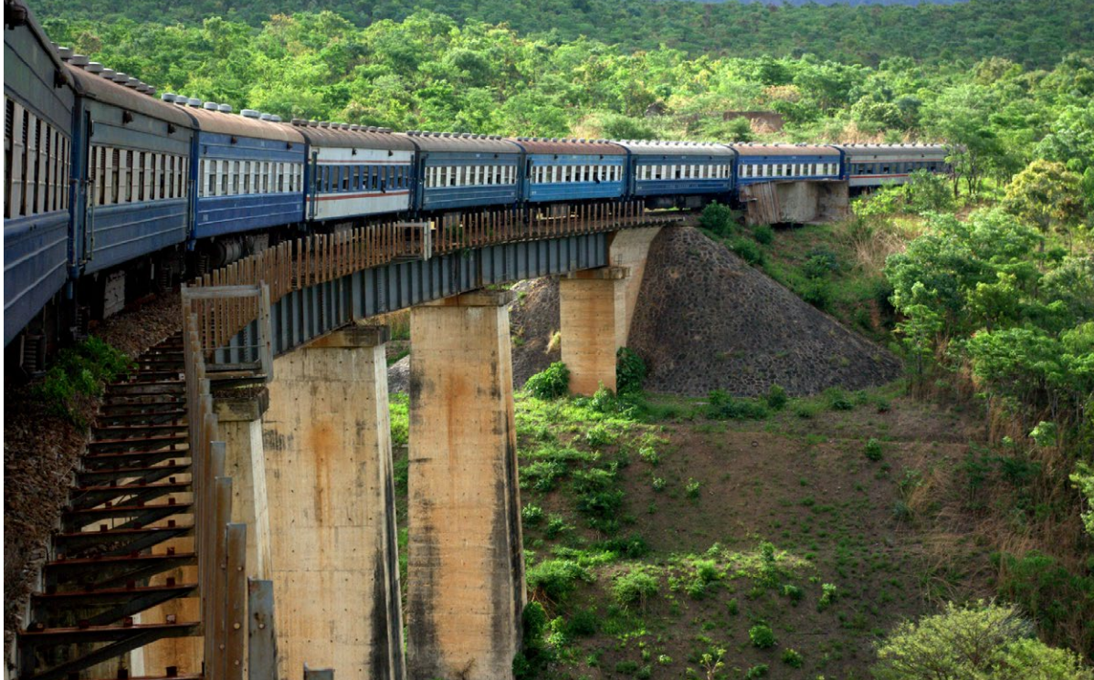
Tazara Rail - Tanza- nia-Zambia, built in the 1970s by the Chinese