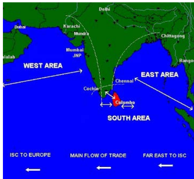
Strategic location of transshipment ports

Similar developments are emerging on the east coast of the Indian Sub-Continent with more direct calls. However, the diversion required for large ships is significantly greater than for the west coast and the traffic volumes are smaller; so this development will take longer to reach a point at which direct calls are justified. All in all, transshipment is a risky business for the ports. It should be realised that this traffic is very foot-lose and competitive. Rates are low and only when high volumes are achieved jointly with a substantial own cargo base, success is possible. Moreover, transshipment rates should not be regulated in view of the international competition in this field.