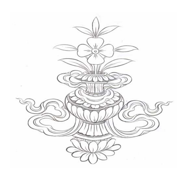
The Precious Vase represents