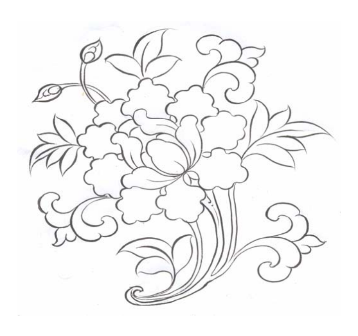
The White Lotus represents