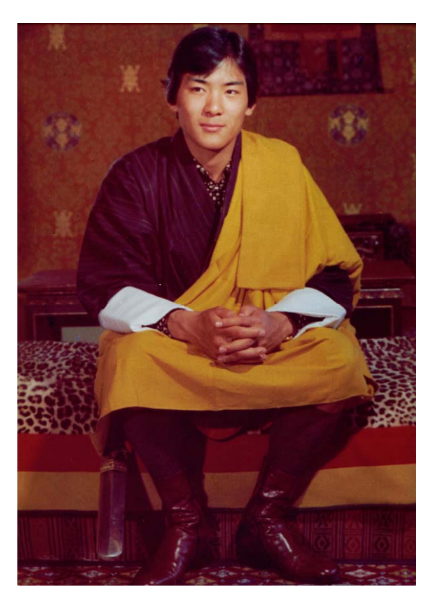
The Author of Gross National Happiness, His Majesty Jigme Singye Wangchuck, the Fourth Druk Gyalpo of the Royal Kingdom of Bhutan