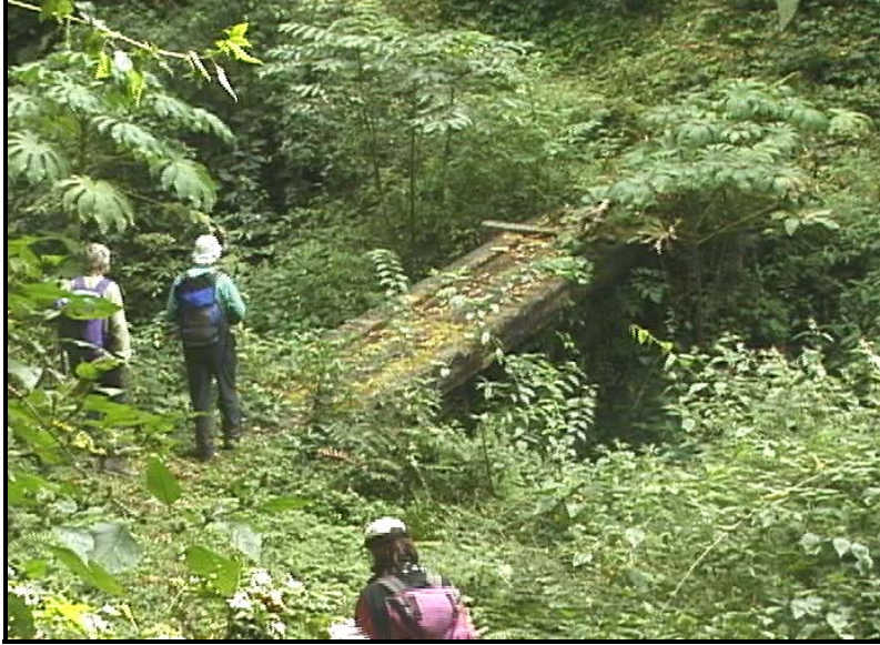
A Wooden Plank Bridge over Churalung

Churalung is a stream. There was once a chura - a traditional water mill built over the river, like the one in Genyechhu, where travellers normally ground their grains. There is no trace of chura today. 46