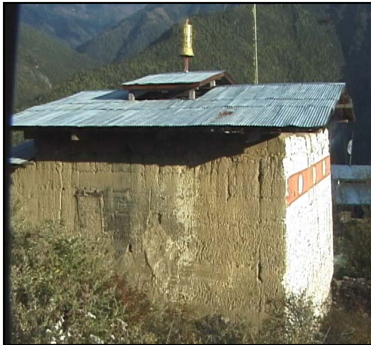
The Remains of Genye Dzong

After the coming of motor road, socio-economic conditions improved. Farmers shifted their farming pattern from a simple subsistence to limited commercial farming. They started to grow potato and pea, and exported to Phuntsholing. Matsutake and chantarelle mushroom found in abundance in the region brought in much needed cash. Farmers now own power tillers for potato and wheat cultivation. A group of villagers (both children and adult) have enrolled in the non-formal education programme.