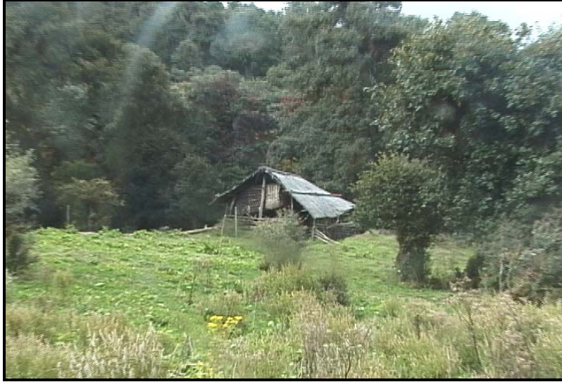
A Dagap Cowshed in Bjetekha

Some dominant trees after passing Wangroo are daegishing (paper tree), aetoshing , bjishing and kharshing . A bamboo species called heeman (reeds) is found in abundance. Karshishing is dominant after crossing a stream called Gyem Semchelungichhu. Za is extracted from karshishing for making phob (cup). Thomshing and phagishing also grow abundantly. People use thomshing leaves to make traditional medicine, while dob and other containers for milking and churning are mostly made from phagishing .