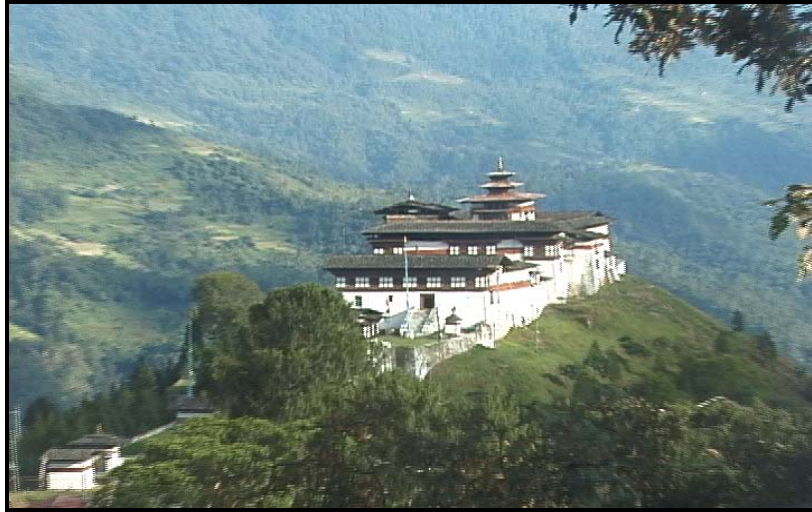
Daga Tashi Yangtse Dzong

After zhung droenyer ( mgron gnyer - chief of protocol) Druk Namgyal brought Dagalungsum under the central rule, he built a dradzong (enemy fortress) in 1652 on a ridge that looks like an elephant's head, below Shelto Goenpa. It was meant to subdue enemies of the southern frontier and to address the spiritual needs of the region. The dzong was named Daga Tashi Yangtse Dzong.