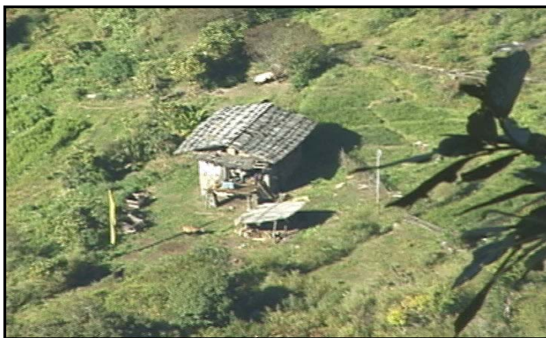
A Single House Settlement of Demi