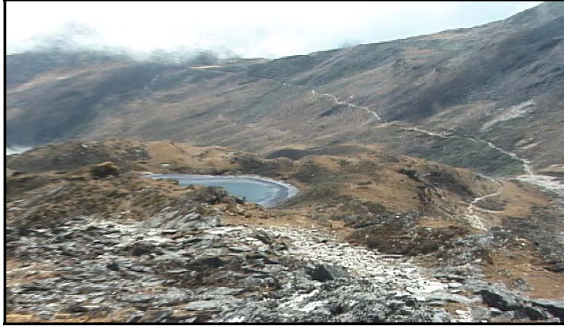
Langtsho and the road beyond Lawagu

From Lawagu Laptsa, the road zigzags down a steep and rocky mountain slope, and passes between Tatsho and Langtsho. There is a small stone bowl above the road where people drop coins as nyendar . The road is difficult for horses. Tatsho was earlier a big lake, but it has dried up after Aum Tshomen escaped to some other place. The Bjop believe that a horse used to appear from the lake. Langtsho is below Tatsho and the road passes above it. People believe that a yak used to appear on the shore and impregnate cows. There is a ruin of a Bjop Khyim in Sipsarbu tsamdo at the base of Goraigang. The Bjop used to live there in ancient days, but it was later abandoned after dud residing in the opposite mountain terrified the people. The walls of the two-storied house are intact, and it is now used for sheltering sheep from cold