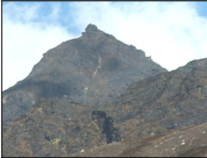
Aum Jomo Dagam's Citadel (Phodrang)

with defilements of birth and death. A visit by either king or men would be favoured with good weather. Like Bjop (her subject, patrons) she moves to warmer abode in Dagana during winter, and returns in the fourth month to reside in her summer abode in Labatama. If she is disturbed or not well propitiated, she sends predators like tigers to kill yaks, and inflicts man and animal with disease. But she is also known to bless her faithful patrons ( Bjop ) by multiplying their cattle and protecting health.