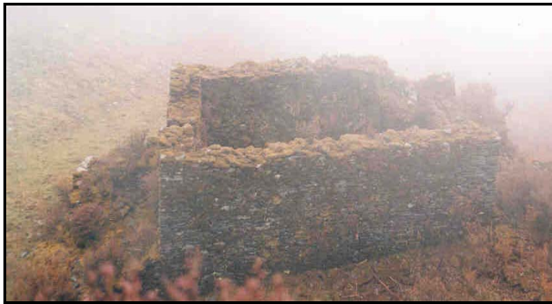
Ruins of Doma Guest House

winter. Gora and Changphetorsaigang tsamdo can be seen from the house. There is a road leading to Kadori tsamdo . From Sipsarbu, some parts of the roads are beautifully paved with stone slabs. Doma 33 is a big tsamdo located at an altitude of 3700 meters. There are ruins of a guesthouse called Doma Gyem Khyim. A rectangle-shaped double-storied stone house was built by Dagap as guesthouse for Daga Penlop. Penlop and travelers shared the upper floor, while horses were sheltered in ground floor. 34