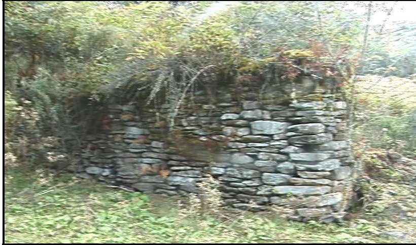
The Ruins of Bjetikha Guest House

The main responsibilities of neydag were to arrange water and fire ( chu okal me okal ), collect firewood, cut fodder for riding ponies, 44 and welcome guests. They provided these commodities to all travelers who reciprocated with food provision, butter, cheese and other goods. Their duties were greater when a Penlop traveled the road. A messenger would inform neydag and villages along the road of the Penlop's journey. When the Penlop approached Bjetikha, the neydag would welcome him with sang . The neydag was not required to provide food for the Penlop and retinue of porters. Early in