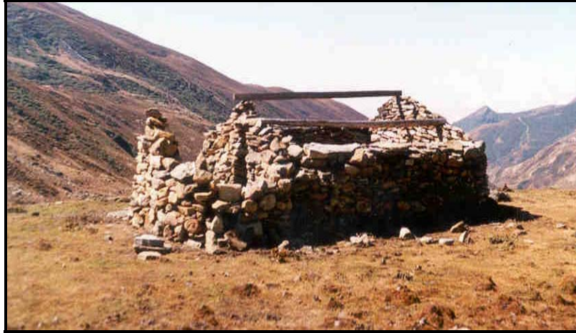
A typical Bjop khyim (cowshed)

Gyalkha 22 are known as Dunbjop. Wambjop constitutes 30 households north of Zhugthri Gyalkha, while Jartala consists of six households in various tsamdo in the Dagala ranges above Tsimalakha. 23