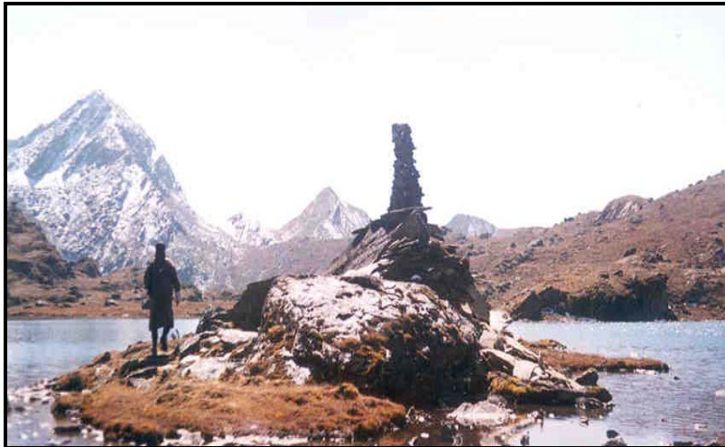
Drupkhang in Bjagaedtsho

Laatsho is the highest and the most sacred lake. It is located on the base of a small mountain next to Aum Jomo's citadel. Supposing that the mountain is Aum Jomo herself, Laatsho is located on her lap. It is considered as Aum Jomo's soelchhu since it is the highest, cleanest and nearest to her abode. Aum Jomo was known to have obstructed an initial attempt to introduce fish in the lake by enveloping the road and Laatsho with thick black clouds so that people could not see both the tsho and the road.