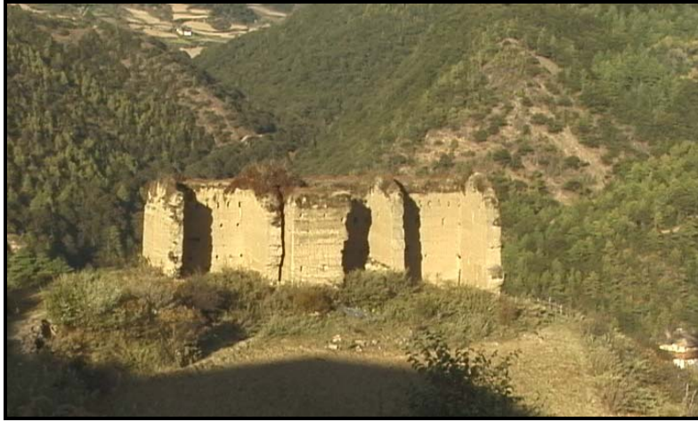
Ruins of Dagap Houses

traditional staple cereal crop then. The drungpa shared some 12 of the harvests with the people. Under this land tenure and taxation system, Dagap moved to Genyekha during summer to farm their land, and in the process they travelled the Genyekha-Dagana zhunglam frequently. They also had to pay other taxes not available in Genyekha in kind. After the post of drungpa was abolished, Dagap passed on their zhing to the locals, 13 and their seasonal movement hence came to an end.