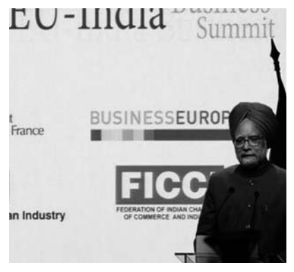
Prime Minister Dr. Manmohan Singh addresses the India-EU Business Summit in Paris, September 2008

The group's 2006 report contains farranging liberalisation 'recommendations', several of which were clearly penned by industry. In its FTA position paper, CII, for example, advocated tariff cuts for "90% of traded goods" 149. This was repeated by the HLTG, which approved the elimination of 90% of all tariffs in the EU and India within a period of only seven years. The group also recommended substantial services liberalisation, improved market access for foreign investors, the free repatriation of their profits, talks about liberalising government procurement markets and the protection and enforcement of IPRs150. With up to a quarter of the seats on the Indian HLTG delegation, CII and FICCI were well positioned to put these issues across<sup>151</sup>. No wonder, they considered their involvement "very important"152.