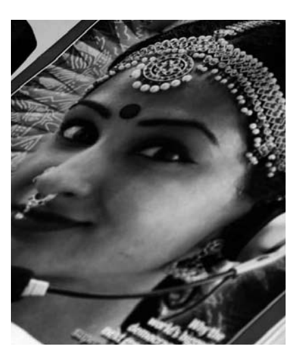
India — country of contrasts