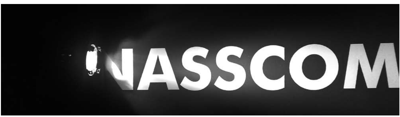
The Indian IT lobby — a lobby giant in the Brussels bubble?

The lobby strategy seems to have been successful. In an exclusive evening event