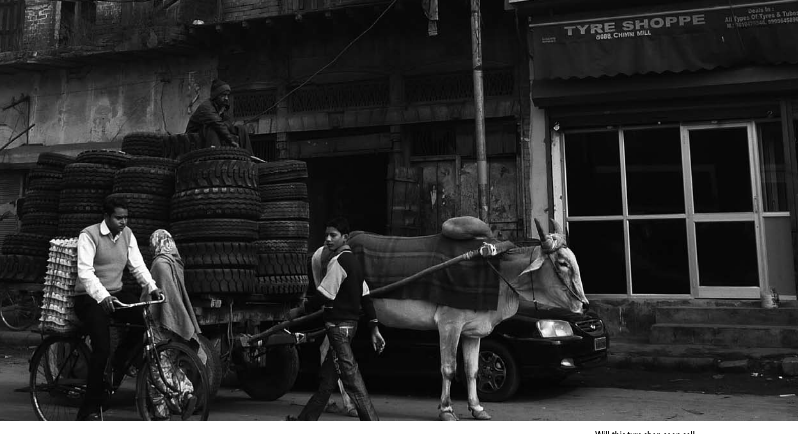
Will this tyre shop soon sell only Continental, Michelin or Pirelli tyres?

that are free from a number of pig diseases. Again, the EU has acted on behalf of the meat industry and criticised the measure for going beyond what is internationally required.