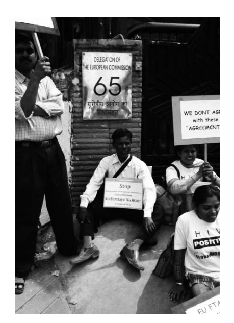
Protest at the EU delegation in Delhi in March 2009: we don't agree with these "agreements"