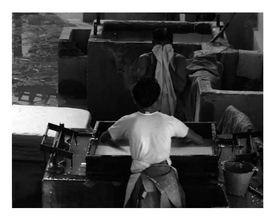
Paper factory in India: will it survive the competition with the Europeans?

meat products – face tariffs of between 20 and 70% in India. The maximum duties that the country could impose are even higher (65-127%)<sup>110</sup>. CIAA, the Confederation of EU Food and Drink industries which lobbies for companies like Unilever, Coca Cola, Danone, Kraft Foods or Nestlé, wants to see these duties dismantled on a reciprocal basis<sup>111</sup>. And it is backed by sectoral associations including Freshfel (fruits and vegetables), Caobisco (chocolate, biscuits and sweets), the Danish meat association, the European Dairy Association (EDA) and the EU dairy trade association (Eucolait)<sup>112</sup>.