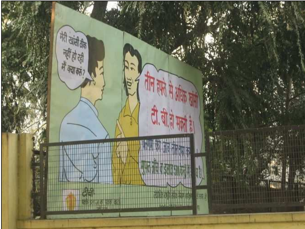
Picture 7: February 2009, tuberculosis awareness campaign, Chanakya Puri, New Delhi. (Translation: “I still have a bad cough. What should I do?...”)