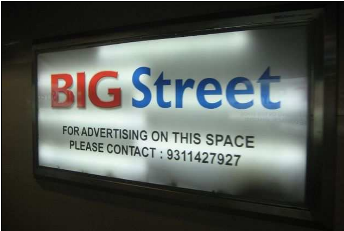
Pictures 20, 21: February 2009, Metro Station Central Secretary, New Delhi.