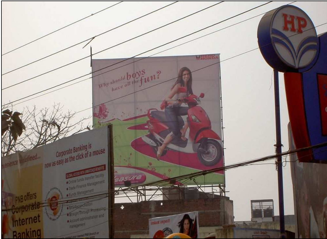
Picture 23: December 2008, ad for Hero Honda, Varanasi. (“Why should boys have all the fun?”)

Similarly, the ad for sanitary pads addresses women menstruating and exclaims: