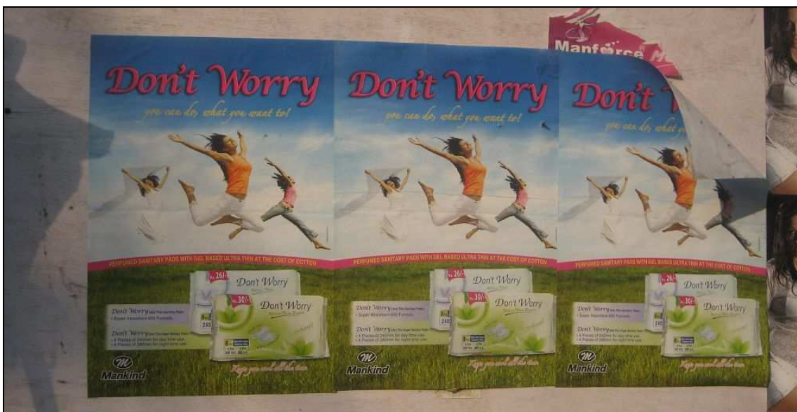
Picture 24: October 2008, ad for Mankind sanitary pads, Green Park market, New Delhi. (“Don’t worry. You can do, what you want to!”)

“Don’t Worry. You can do what you want to!” and thereby declares that women are able to make their own choices.