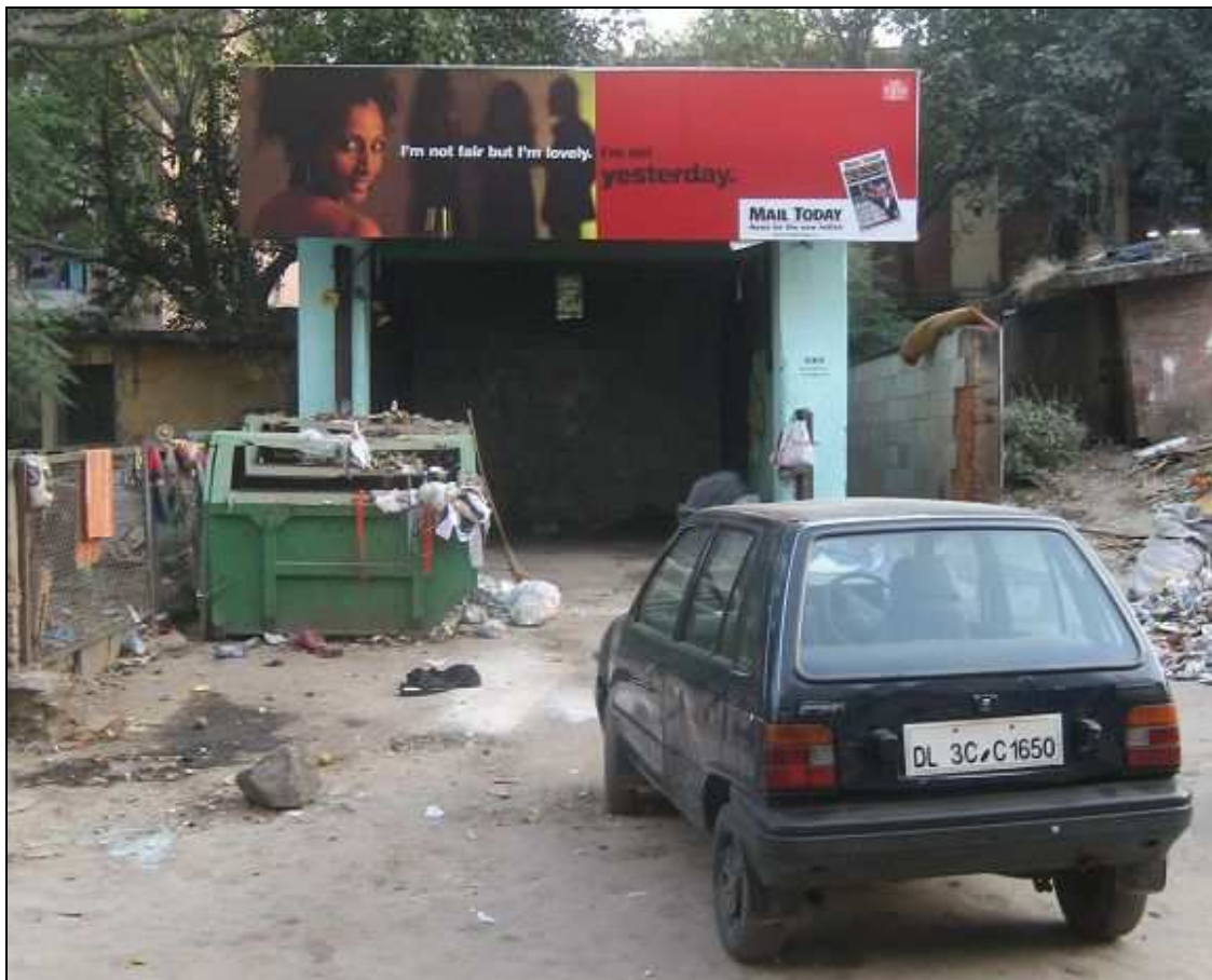
Picture 19: October 2008, neighbourhood waste dump, Safdarjung Enclave, New Delhi. (“I’m not fair but I’m lovely. I’m not yesterday.”)

In addition, the emergence of the metro in New Delhi, which is affordable for all, demonstrates that the availability of messages for an audience that is a mixture of class and caste is higher than anywhere else. The possible amount and diversity of advertising in these areas is vast (see pictures 20, 21).