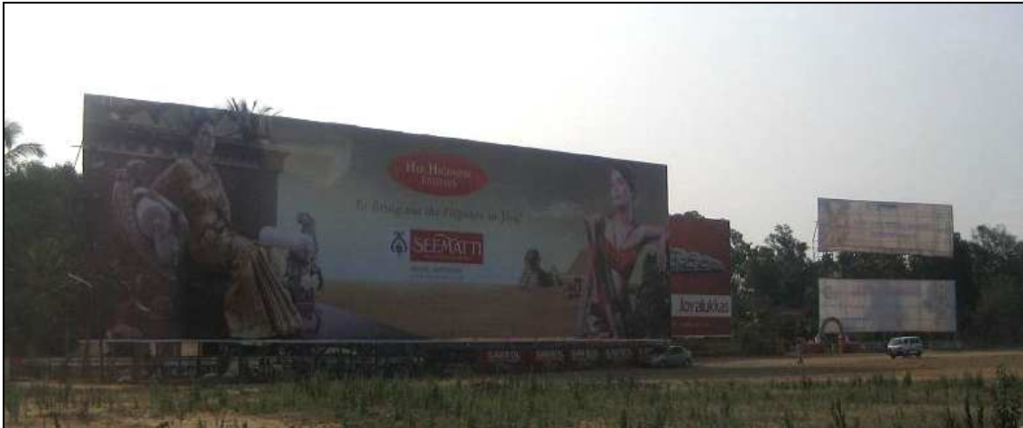
Picture 1: January 2009, oversized billboard (notice the minivan), Kerala.

Outdoor advertisement (billboards, posters, hoardings and most recently digital media) excludes television media, print media in magazines and internet which are generally the biggest forms of advertising. Even though outdoor advertising was said to only hold a part of 5.5% of total advertising in the years from 1993-1997 (Ciochetto 2004:6) the amount of billboards and other outdoor media has in the new millennium spurned different activities of restrictions to limit the numbers and size of hoardings (see pictures 1), especially because many are suspected to be illegal (Blecken 2009).