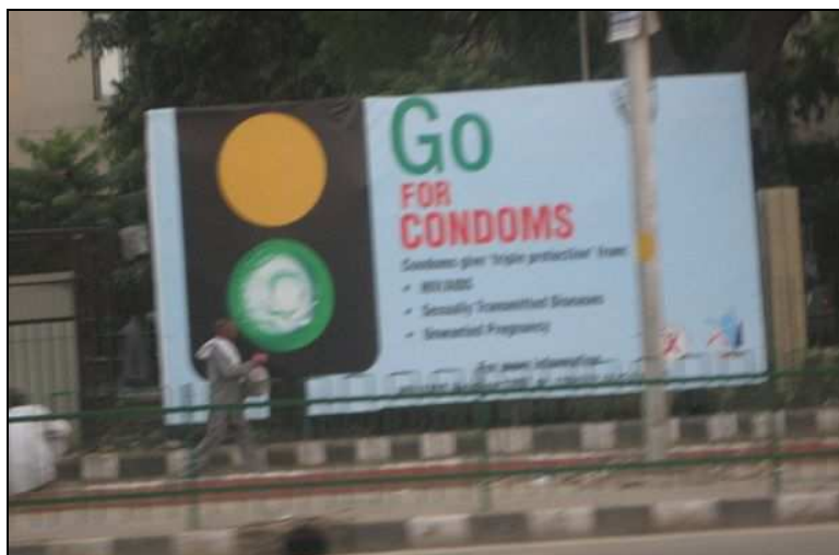
Picture 4: October 2008, near A.I.I.M.S (one of the biggest hospitals in New Delhi), Safdarjung, New Delhi (“Go for Condoms”).

During my stay in New Delhi in the autumn of 2008 I noticed a great number of advertisements for HIV/AIDS awareness; still a hot topic in international development and acknowledged as an issue of priority in governmental bodies (see pictures 4, 5, 6).